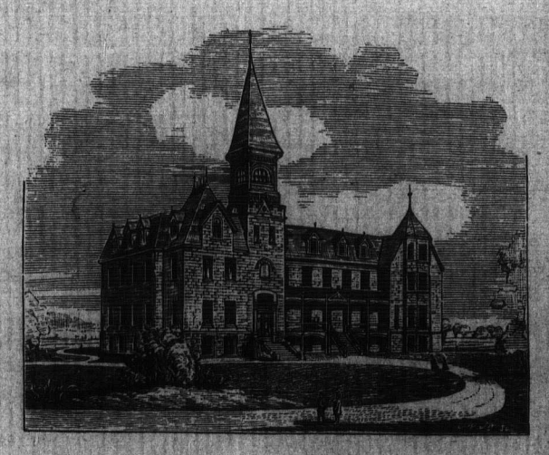
THE COUNTRY HOUSE ON THE MOLSON FARM.