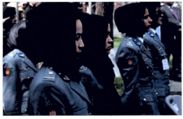
Police officers at the ceremony for the Women's Police Town in Kabul, April 9, 2018.

Objective 3: Promote and protect women's and girls' human rights, gender equality and the empowerment of women and girls in fragile, conflict and post-conflict settings