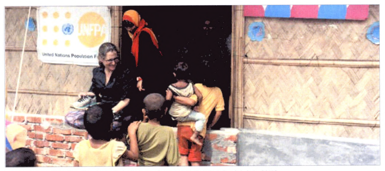
Minister of Foreign Affairs Chrystia Freeland visits the Rohingya refugee camps in Cox's Bazar, Bangladesh, April 2018

Objective 2: Prevent, respond to and end impunity for sexual and gender-based violence, and sexual exploitation and abuse by peacekeepers and other international personnel, including humanitarian and development staff