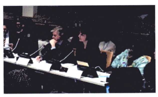
Women peacebuilders from Burundi and Mali and the Under-Secretary-General for Peacekeeping Operations at a Canadian-French side event at the UN Commission on the Status of Women in New York, March 2018.

Objective 1: Increase the meaningful participation of women, women's organizations and networks in conflict prevention, conflict resolution, and post-conflict statebuilding