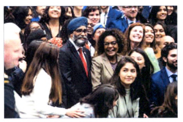
Minister of National Defence Harjit Sajjan with Secretary-General of the Organisation of la Francophonie Michaëlle Jean and youth peacebuilders at the UN peacekeeping ministerial meeting in Vancouver, November 2017.

Objective 5: Strengthen the capacity of peace operations to advance the WPS agenda, including by deploying more women and fully embedding the WPS agenda into CAF operations and police deployments