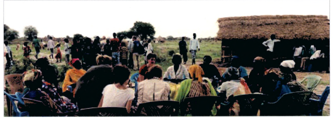
Minister of International Development Marie-Claude Bibeau visits South Sudan in June 2017.

"In South Sudan, strong social and institutional norms and attitudes impede the inclusion of women and women's rights in local, regional and national decision making. To help tackle this, the embassy brings advocacy and programming together, for example by supporting grassroots women's rights organizations in their efforts to promote women's rights, and working with women leaders who are actively engaged in ensuring that women's interests are advanced by the peace process."