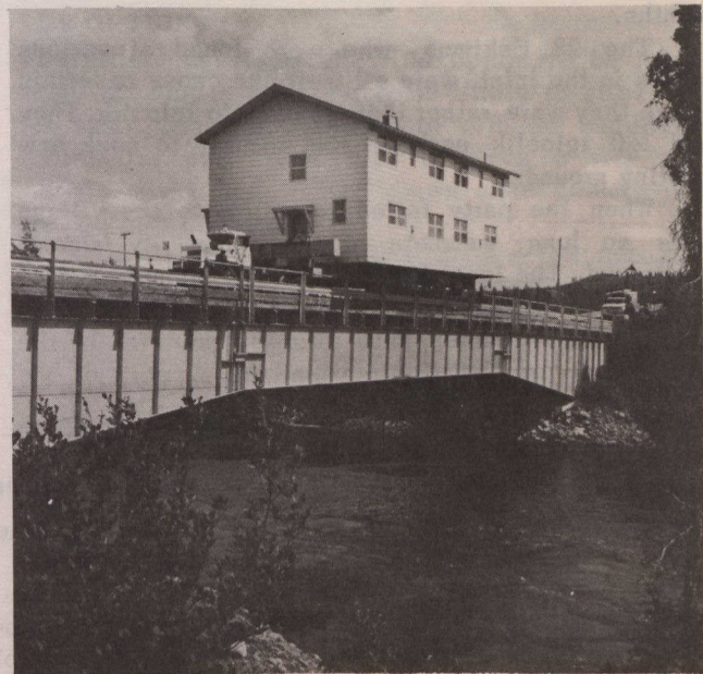
Crossing the Unknown River is one of seven homes moved recently from Twin Falls to Churchill Falls, Newfoundland.

Ingredients for making the move: gently lift the homes from one foundation; transport them 32 miles and set them softly onto another foundation; include blocks, rollers, 'I' beams, multi-ton jacks, patience and - most important - know-how.