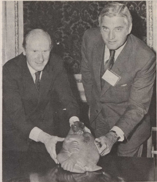
GIFT OF ESKIMO CARVING

The mining and processing facilities to be established by Inco Indonesia in the vicinity of Soroako in eastern Sulawesi represent the first stage in a planned development of the lateritic ores in the area under the Contract of Work with the Indonesian Government. The annual production capacity of the initial plant will be 14,000 metric tons of nickel and cobalt in the form of a 75 percent nickel matte product.