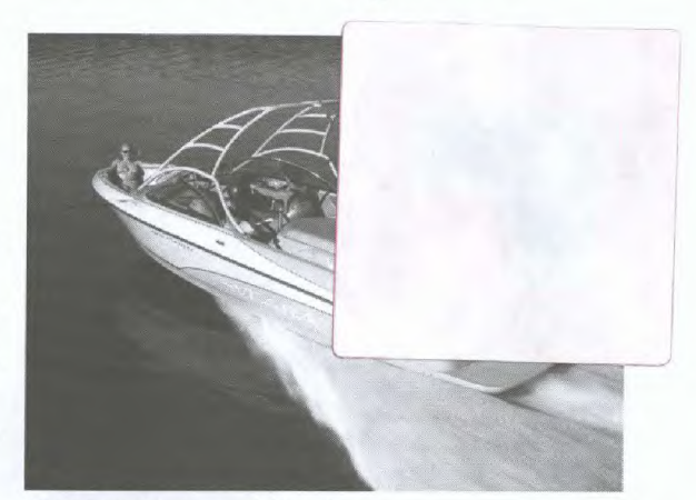
SVFARA's SV696 model tow boat

Often referred to as the Ferrari of tournament tow boats. SVFARA boats meet Canadian and U.S. coast guard