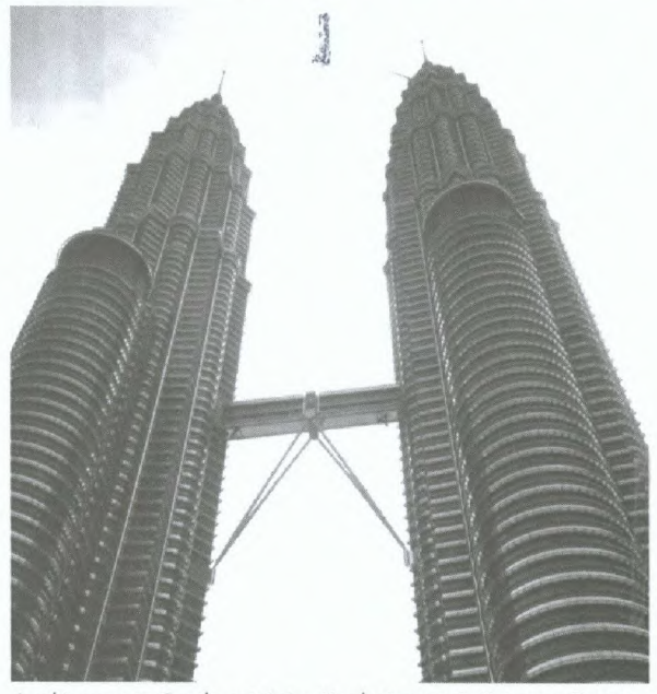
Looking up to Southeast Asia: Kuala Lumpur's Petronas Towers stand tall.