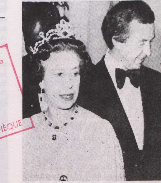
Prime Minister Joe Clark and Queen Elizabeth II at a banquet for representatives to the Commonwealth conference.

discussion on the current problems of southern Africa and their implications for the Commonwealth and the wider international community. While recognizing that certain developments since their meeting in London have added new dimensions, they remained concerned by the potential dangers inherent in the existing situation. They therefore stressed the urgent need for finding satisfactory solutions to the remaining problems of this region.