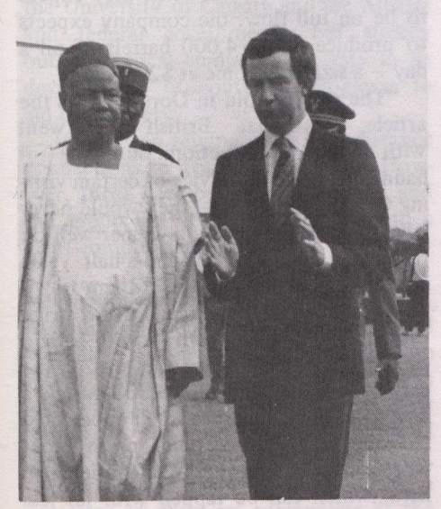
The Prime Minister is greeted by Cameroun's President Ahidjo.

The Prime Minister and the President also joined Secretary of State for Exter-