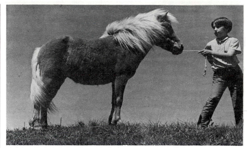
The work horse has disappeared from the farm, but a boy and his pony is still the perfect combination for a Canadian

The Board recommended that comparative food-prices information be published from time to time, over short