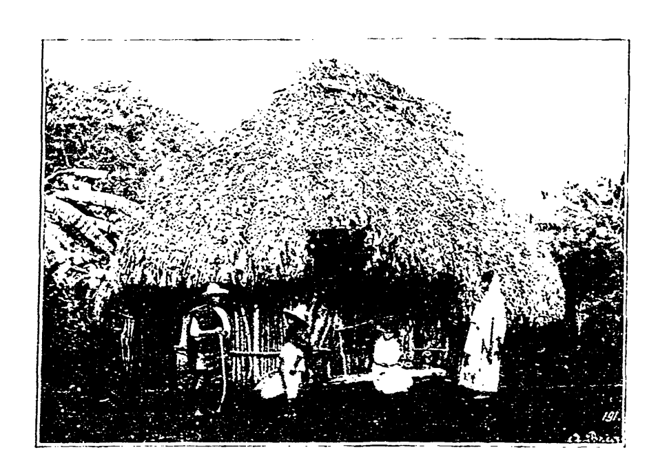
NATIVE HUT NEAR CORDOVA, VERA-CRUZ, MEXICO.