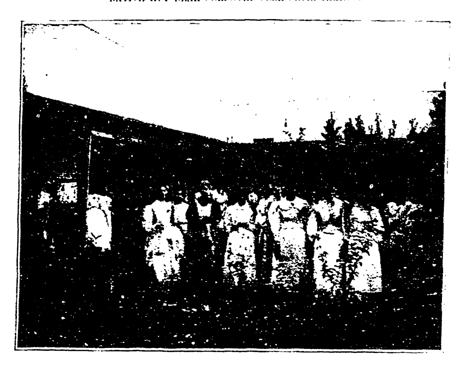
GIRLS' SCHOOL, PRESBYTERIAN MISSION, SALTILLO, MEXICO.