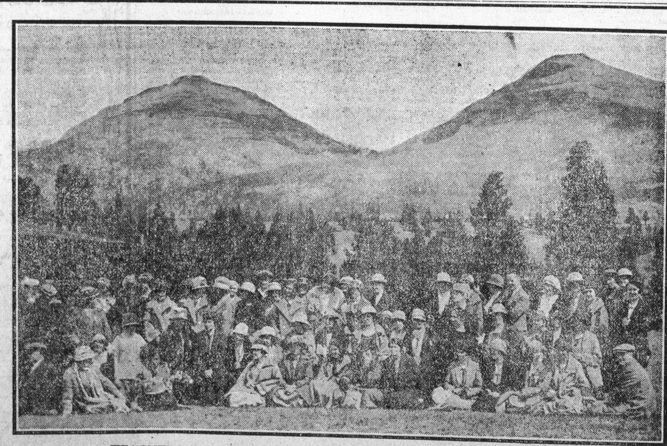
TEACHERS FEDERATION VISITS WINDERMERE BUNGALOW CAMP

Petrolia Rugby Club reorganized last week and will enter both inter-mediate and junior teams in the mediate and just O.R.F.U. this fall.