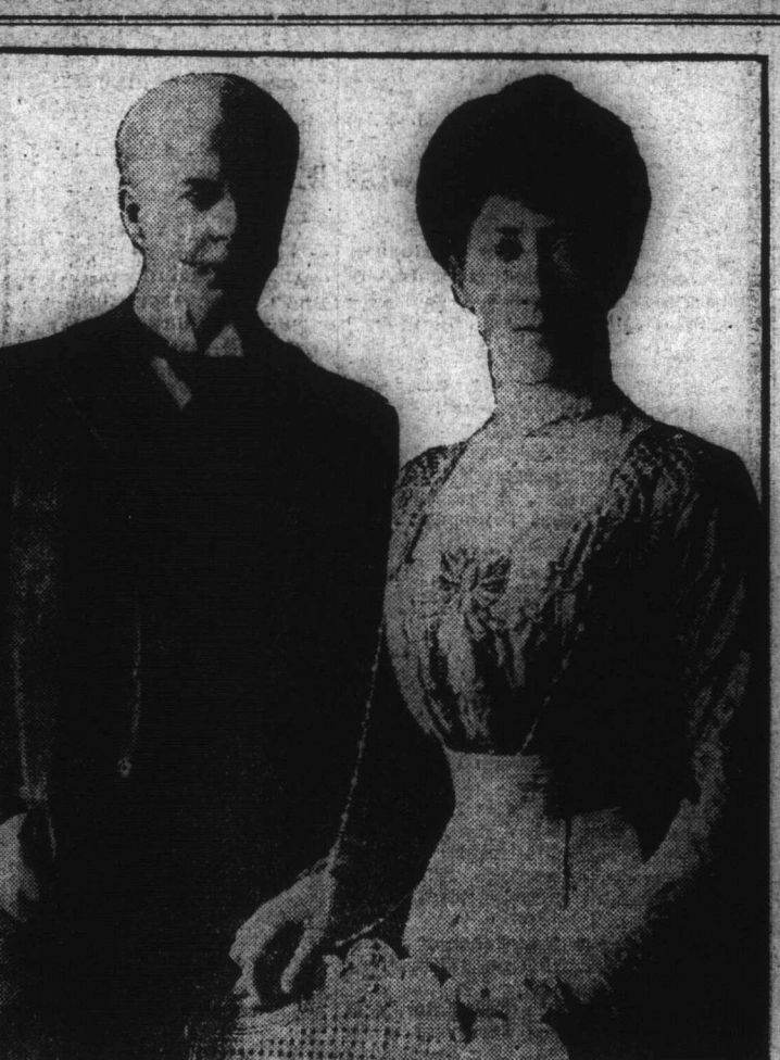
DUKE AND DUCHESS OF FIFE—The duchess is a daughter of the late King.