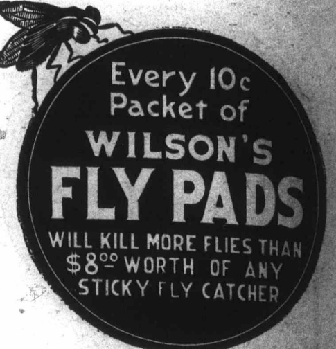
Clean to handle. Sold by all Drug gists, Grocers and General Stores.

He went even farther; for, not content with teaching them merely to live in peace and happiness, he instructed the cat and the little birds to play a kind of game, in which each had to learn its own part, and, after some little trouble in training, each performed with readiness the par-ticular duty assigned to it. Puss was instructed to curl herself into a circle, with her head between her paws, and appear buried in sleep. The cage was then opened, and the little, tricksy birds rushed out upon her, and endeavoured to awaken her