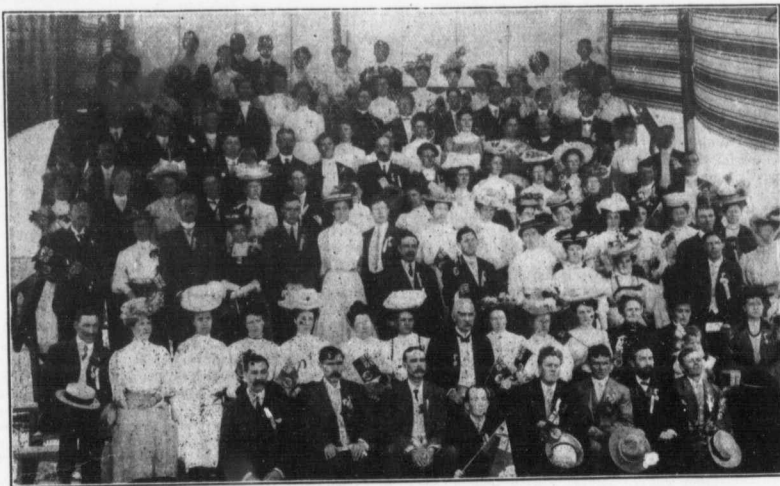
CANADIAN DELEGATES AT THE SEATTLE CHRISTIAN ENDEAVOR CONVENTION

In a country like Canada young men should prepare themselves to take their full share in the civic, provincial and Dominion affairs of our great and growing country. This can be greatly furthered in a variety of ways. Debating clubs, by keeping up a high intellectual level and dealing only with great themes, requiring thorough research and independent thought, may produce men who shall make their mark upon the history of the Dominion. In order to do this a certain portion of every day must be sacredly devoted to reading. In this, as in other things, men do not happen to succeed.