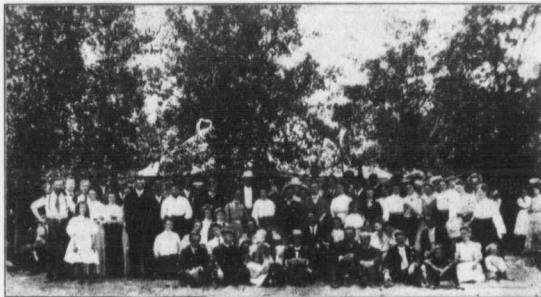
LAKE DAUPHIN SUMMER SCHOOL

Oct. 1.—Chatham District, at Wallaceburg.