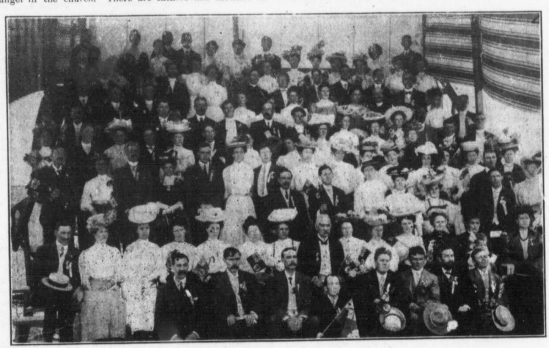
CANADIAN DELEGATES AT THE SEATTLE CHRISTIAN ENDEAVOR CONVENTION

In a country like Canada young men should prepare themselves to take their full share in the civic, provincial and Dominion affairs of our great and growing country. This can be greatly furthered in a variety of ways. Debating clubs, by keeping up a high intellectual level and dealing only with great themes, requiring thorough research and independent thought, may produce men who shall make their mark upon the history of the Dominion. In order to do this a certain portion of every day must be sacredly devoted to reading. In this, as in other things, men do not happen to succeed.