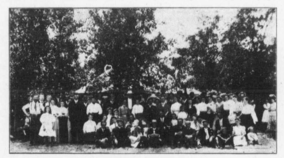
LAKE DAUPHIN SUMMER SCHOOL

The interests of the Sunday School and Epworth League were in good keeping in