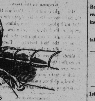
JUST IN FROM MUSQUODOBON.

Such an overhauling of trunks and grips by the officials goes on inside. Everybody wants to get away at once, and as there are 25 trunks to one inspector, and half the keys of the 25 are missing, "when" most needed, the result is anything but soothing