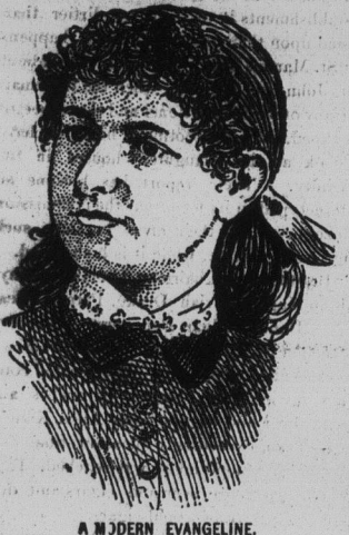
A MODERN EVANGELINE.

MARITIME CANADIANS IN THE NEW ENGLAND STATES. Their Departure and Journey, Arrival and Work Afterwards.