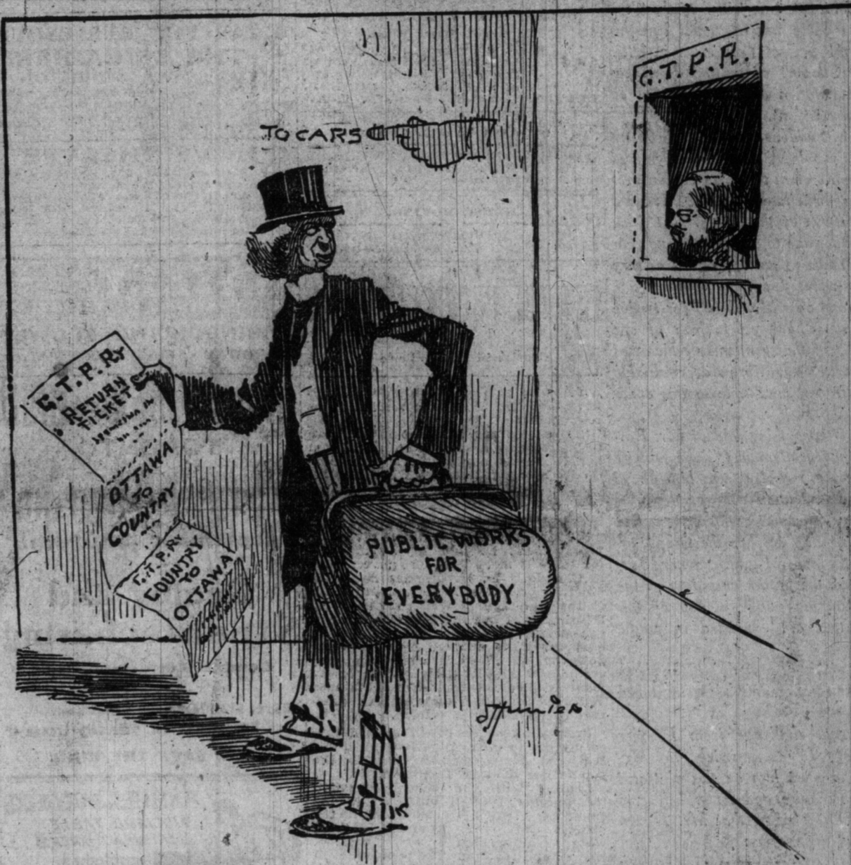
TRAVELER LAURIER: And They Give No Accident Insurance Policy With It, Either.