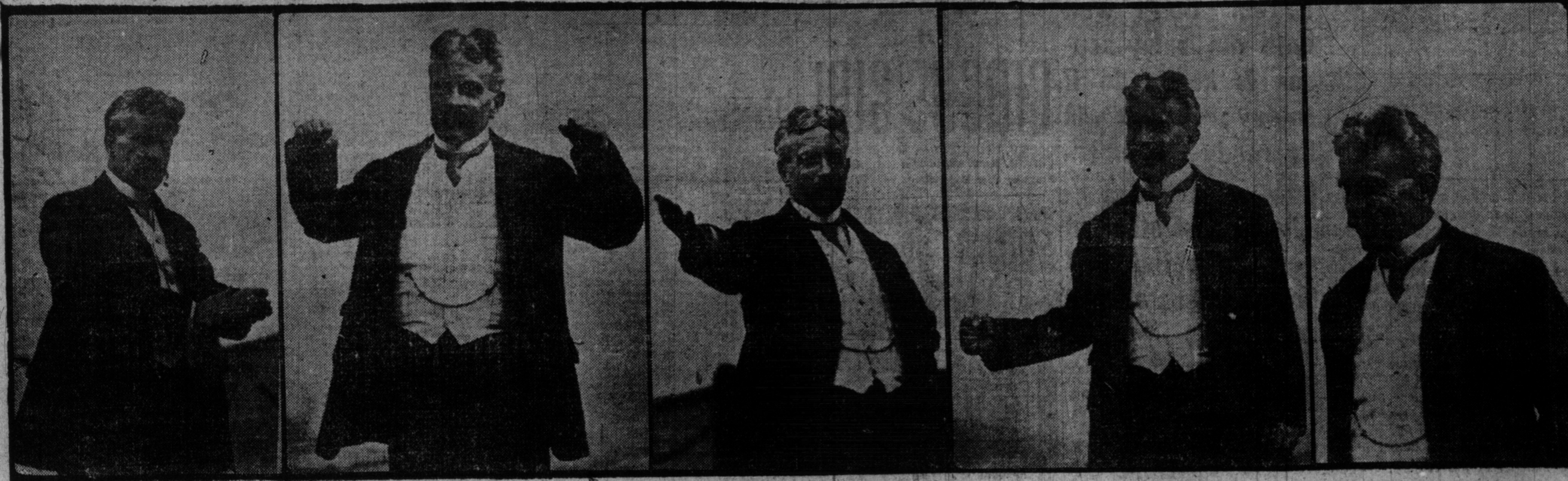
R.L. Borden, as He Was Seen By Last Night's Audiences