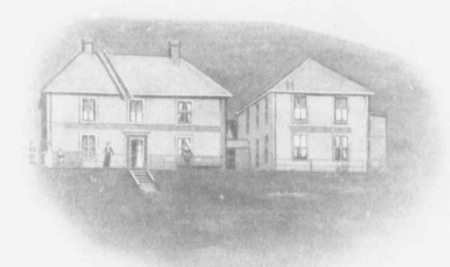
Battle Harbor Hospital