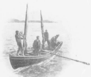
Off For The Doctor