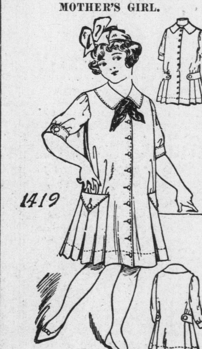
Girl's Dress with Sleeve in Either of Two Lengths.

1419.—A CHARMING DRESS FOR MOTHER'S GIRL.