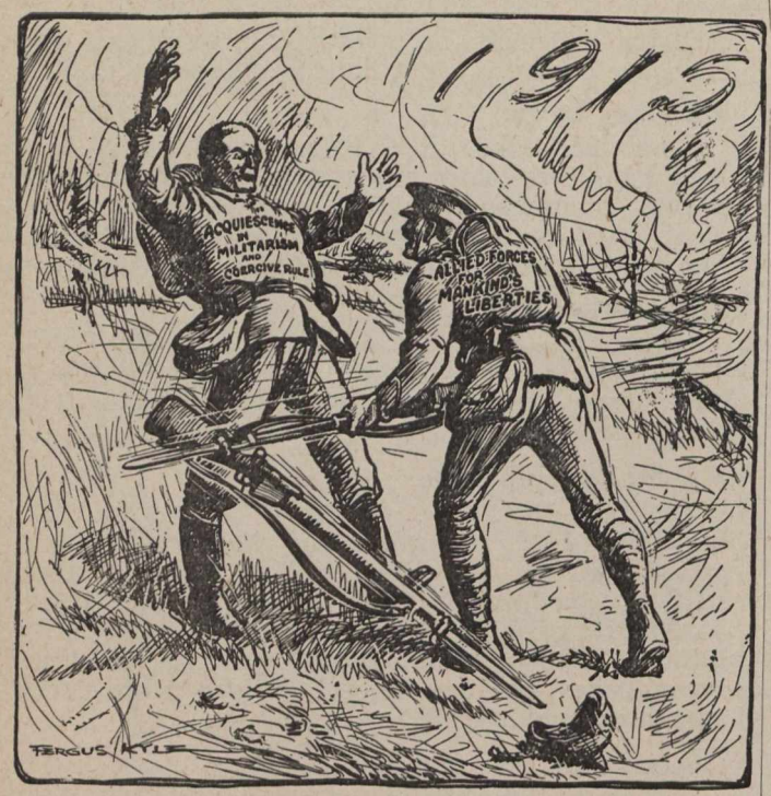
"Had enough, have you? Remember this is for keeps."