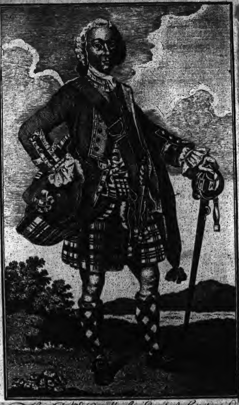
Capt General Covernour in Clief of Links forces in North America; and one of the Sixteen Power of Leviland.