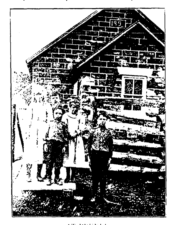
AT BRUNEL, better. So in the Fall of (89) we began to feel our way in this new departure, and a small party of little boys was

In Canadian life at the age when it was no effort for them to adapt themselves to altered conditions. A boy of 1_4 + r + 5 has acquired habits of conduct and ways of living according to the surroundings under which he has been placed, and when he finds himself in a new country he realizes that it is "new," and it takes him a certain amount of time to come to his bearings, and in cases where a boy's temperament lacks " elasticity." the process is sometimes a difficult and a critical one. A child of 6 or 7, on the contrary, has had no time to strike root and his mind and hibits are unformed, and when these little chaps find themselves in good comfortable Canadian homes, England and English life very soon fide away from their recollection and becomes a very dim, and distant memory. They become at once Canadian in deas and speech and habits, and Canada being the country of their adoption, the sooner, they do so the