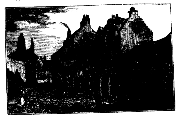
WHITE HORSE INN,

interior. The house had originally belonged to the Abbot of Dunfermline, the