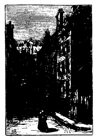
COLLEGE WYND, WHERE SCOTT WAS BORN.

'I have seen many a bear led by a man, but I never before saw a man led by a bear.' No doubt her provocations were great, and she wins the compassionate sympathy of all good house-