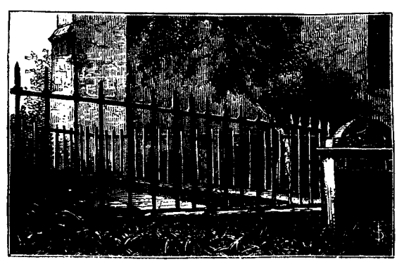
STONE ON WHICH THE COVENANT WAS SIGNED.

newspapers, in the year 1876, the following extract from a debtor's letter, in which he makes his terms with the sheriff: 'However, desirous I am to obey the order of the sheriff to attend my examination, I am sorry to be obliged to intimate that in consequence of the vindictive and oppressive proceedings of some of my creditors, I cannot present myself in court at the diet fixed, unless protection from personal diligence be granted. I will have much pleasure, however, in attending the court in the event of the sheriff granting a special warrant to bring me from the sanctuary, which warrant shall protect me against arrest for debt and other civil obligations while under