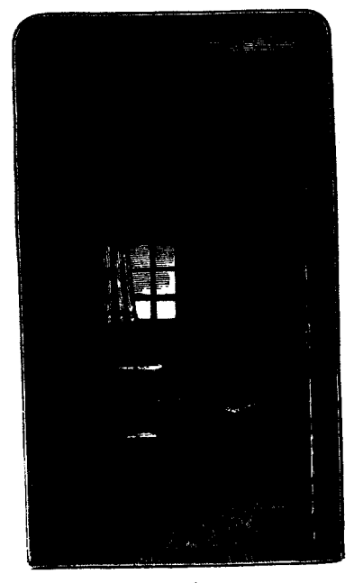
JOHN KNOX'S STUDY.

Nay, curse him not : perhaps now he, Stung with remorse, is blessing thee ; Perhaps at death, for who can tell But the great Judge of heaven and hell,