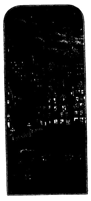
OLD EDINBURGH BY NIGHT.

or not their disappearance, according as his views may be sentimental or sanitarian. They are truly ill adapted to modern ideas of hygiene, or to those cunning modern devices which sometimes poison their very inventors.