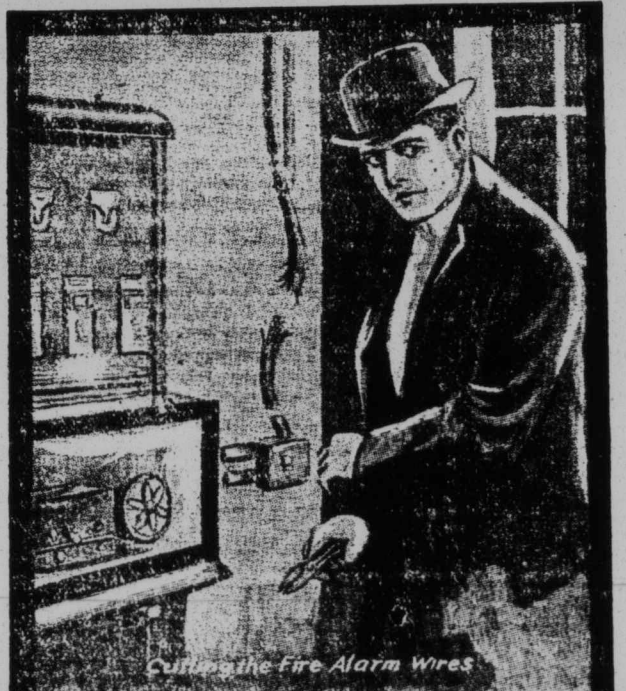
SCENE FROM "THE STILL ALARM" AT THE HAPPY HOUR WED.