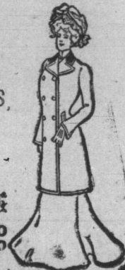
Tailor-made Skirts this Style, Black & Colors $2.50 to 5.00

This department has always been a special feature with us, and this season we are better prepared for business than ever before. A few only of our values we are showing we quote below :