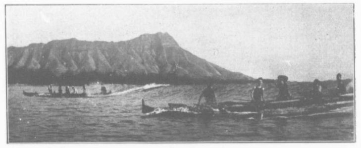
HAWAII.-DIAMOND HEAD AND A PARTY OF TOURISTS ENJOYING THE EXCITING SPORT OF RIDING THE SURF IN OUT-RIGGER CANOES.