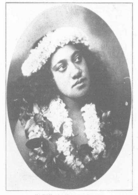
HAWAII.-AN HAWAIIAN BEAUTY.

present generation speak, read and write English. The Hawaiian language is maintained in some degree of purity by the older natives, who also, with few exceptions, speak English. The Oriental languages are used by a large section of the population. Business may be transacted in English in every section of the archipelago. The Territorial Normal School affords instruction in academic branches and science of education; besides training for practice in teaching, manual training, etc.