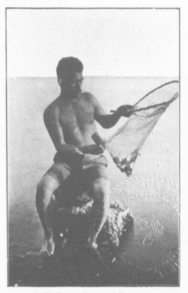
HAWAII.-AN HAWAIIAN FISHERMAN.

Ves, young man, we are aware that $50 may look as big as fifty cart wheels to-day, but it means $160 or more per year to your widow after you are under the sod.