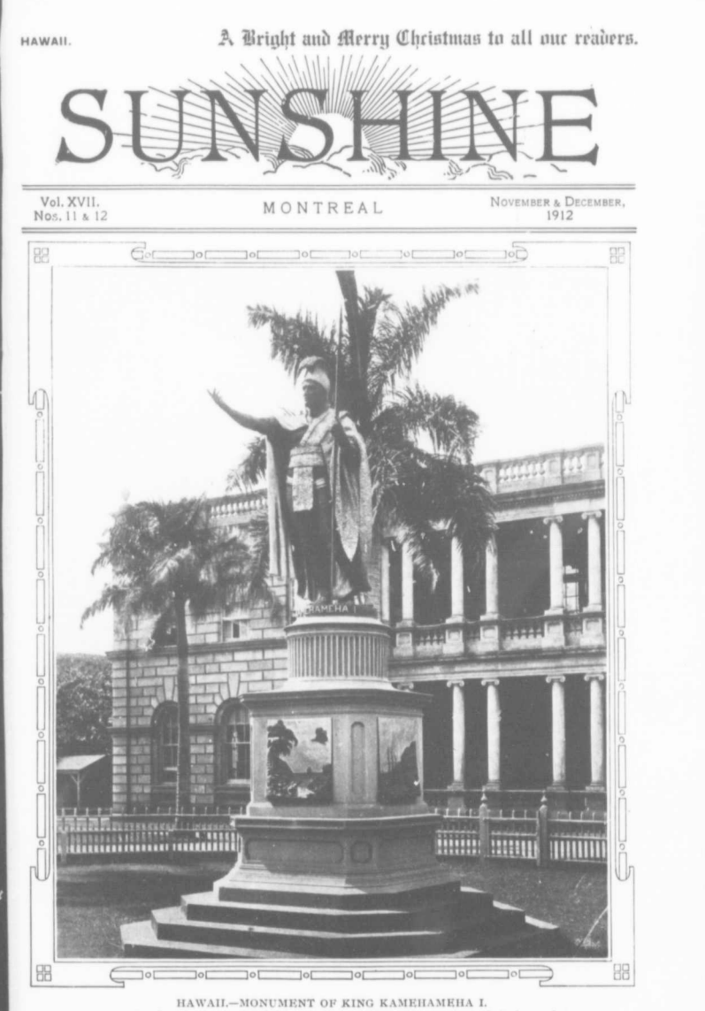
First Ruler of the entire group of the Hawaiian Islands. This statue stands in front of the Judiciary Building, Honolulu.