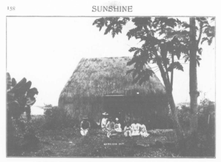
HAWAII.-AN HAWAIIAN HUT WHICH WILL SOON BE A THING OF THE PAST.