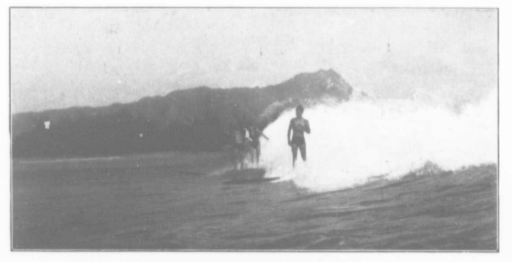
HAWAIL-NATIVES RIDING SURF BOARDS AT WAIKIKI.