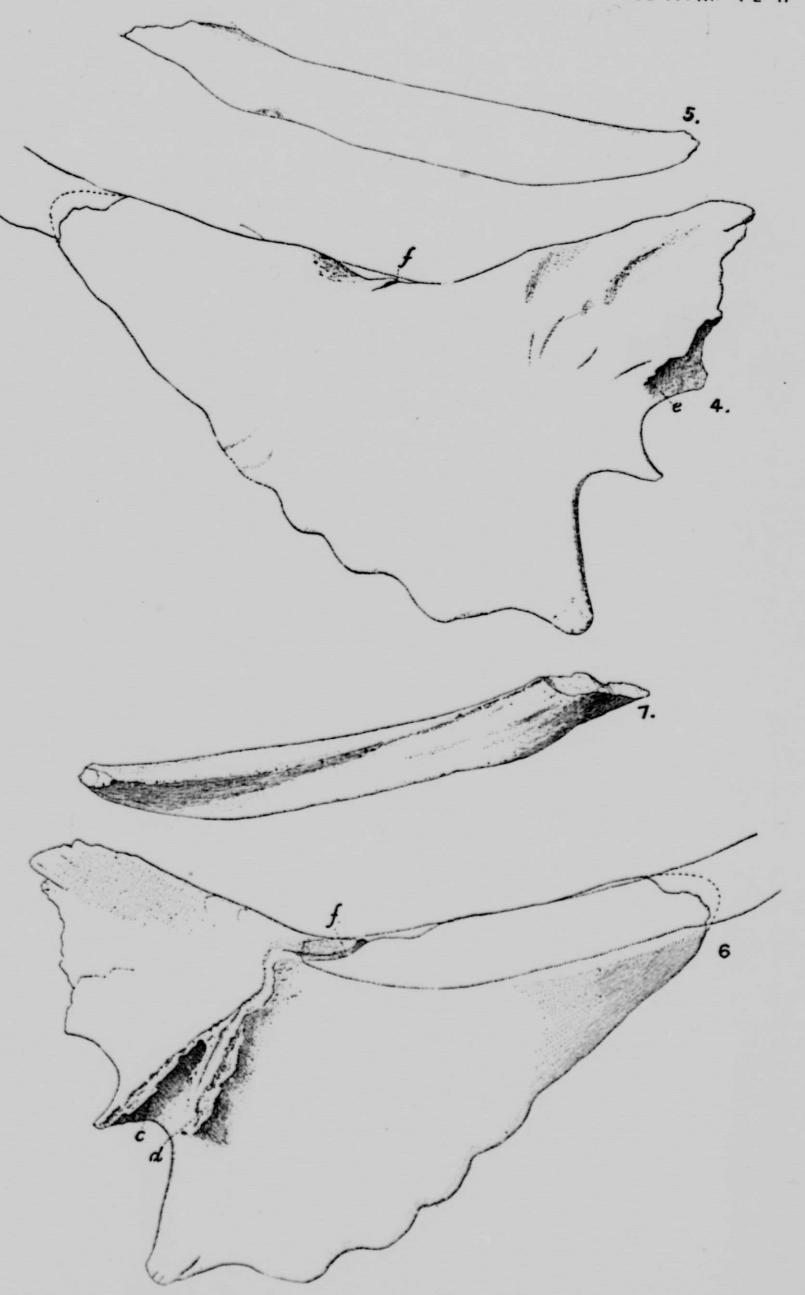
VOL XVIII. PL. II