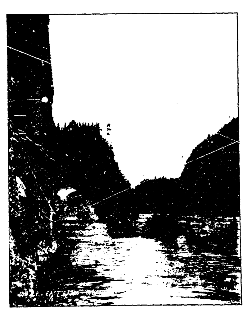
East Rapids, Split Rock, Nepigon River.

But the case in respect to numbers is not quite hopeless. The mission even yet may grow. The host of pagans wandering in these wilds may yet be induced to throw in their lot with us. Certainly no finer site for a settlement exists than at Negwenenang. The land is good, the bay is full of fish, the place is healthy, and the scenery is magnificent. As the game fails more and more the Indians must seek their living from the soil and