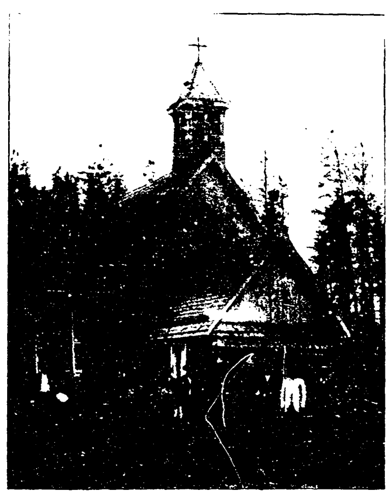
The Church, English Church Mission, Negwenenang, Lake Nepigon.

The Chief, whose only duty it is to act as spokesman, made a speech of welcome in the name of all. "Last year," he said, "when you left us, it was as though the sun had set forever, our hearts were