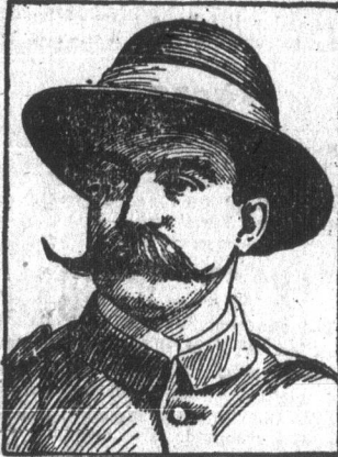
GENERAL G. D. JOUBERT.

The first settlers will be furnished with 3,000 cattle and 1,000 horses.