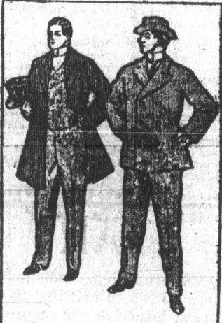
FROCK COAT AND BUSINESS SUIT.

After business is over a frock coat is the correct thing with a Chesterfield or a skirted overcoat.