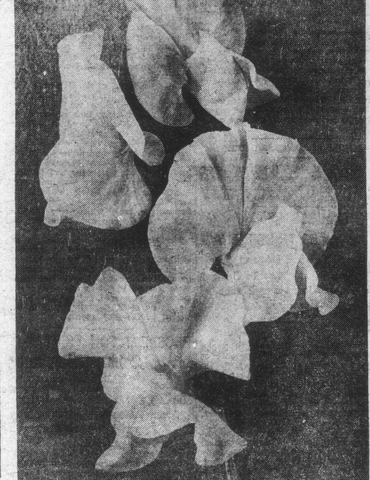
THE NEW SWEET PEA. "JIMMIE BLAND."