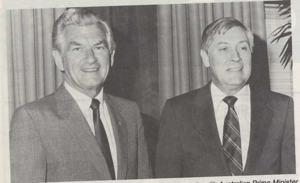
Minister for International Trade James Kelleher (right) meets with Australian Prime Minister Bob Hawke in Canberra to review a number of bilateral questions.

exports to New Zealand are the highest in the Pacific Rim. In 1984, Canada exported $189.4 million worth of goods to New Zealand, 3 per cent of which were manufactured goods. There are almost 600 Canadian firms in New Zealand supplying markets and actively seeking new opportunities through local firms acting as their representatives.