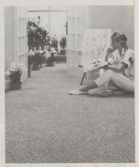
Coronet produces stylish broadloom carpets.

from annual shipments of $3 million in the mid-1970s to $65 million by 1980 and have stabilized near record levels over the past five years. This represents about 11 per cent of all Canadian sales. The key markets are Australia, the United States, the Middle East, Pacific Rim countries and the Caribbean.