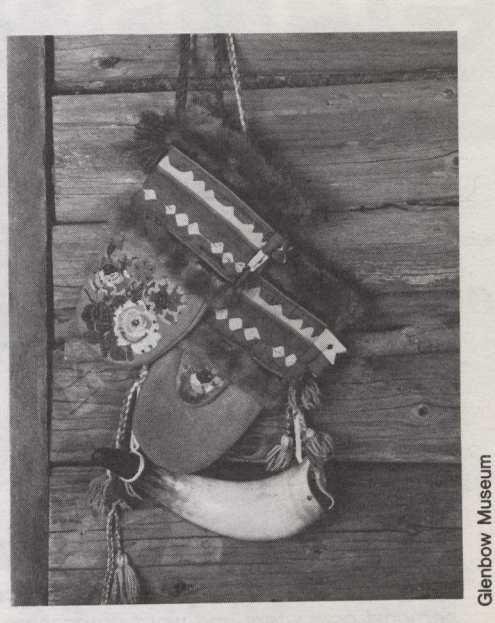
The Glenbow exhibition includes many special Métis items like smoked-hide mitts with elaborate floral beadwork and a powder horn which at one time was a most valued item to Métis hunters.

This year, the Métis in western Canada, with funding from the federal and provingovernments, organized a number of Cial