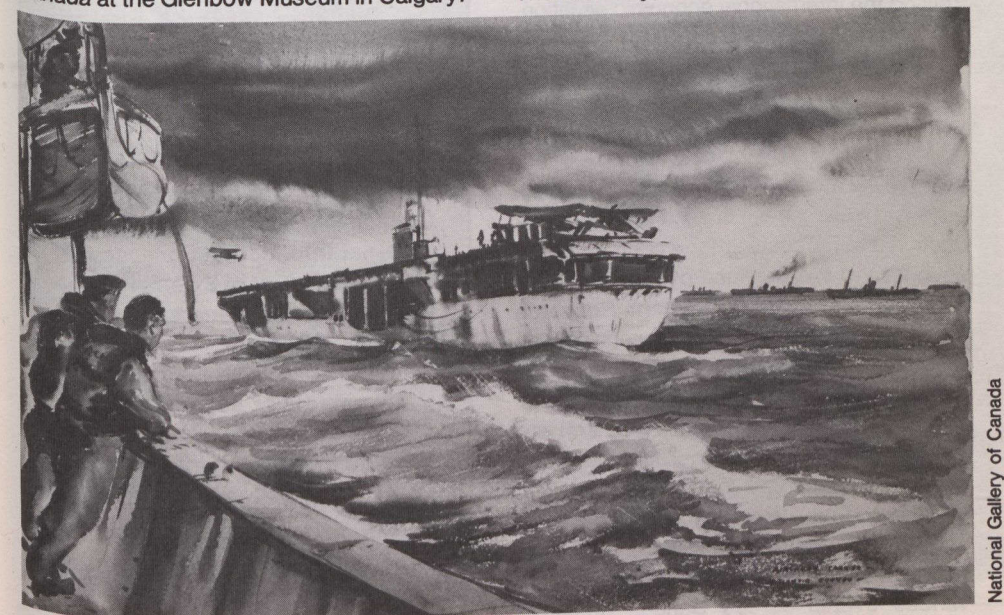
The above watercolour, Aircraft Carrier, Atlantic Convoy by Frank Leonard Brooks, is one of the 50 works selected for the naval exhibit by the Canadian War Museum.

The exhibition reflects naval development and changes in Canada, in 50 works selected by the Canadian War Museum from Canada's collection of more than 7 800 war paintings and sculptures. Recently on view in Moncton, New Brunswick, the exhibition will also travel to Montreal, Quebec, and Thunder Bay, Ontario.