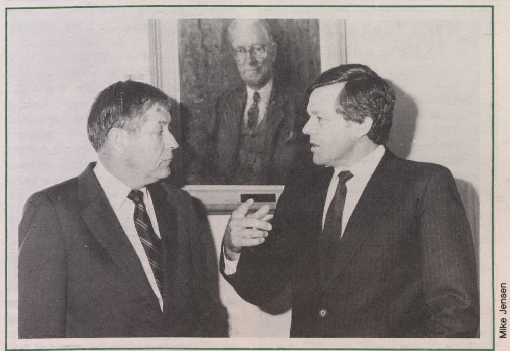
Canadian (left) and Australian trade ministers discuss economic issues.

Currently, on a per capita basis, Canadian