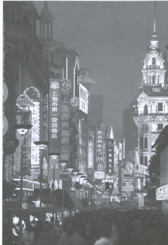
Canadians say China holds the greatest potential for exports and investment, according to a recent poll.

Regionally, there were differences in views about China. While Quebecers were split on whether China or the U.S. holds more potential for exports and investment, the rest of Canada chose China over the U.S. by a margin of 18 percentage points. The gap in favour of China was even larger in western provinces, especially British Columbia, where 57% of respondents said China had the most potential, compared with only 18% who chose the U.S.