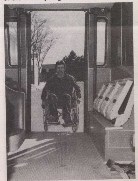
A "kneeling" system means the bus can be lowered for wheelchair passengers.

Two years ago a crew of seven engineers and six ship personnel began the detailed design and assembling of OBI's new vehicle. There were at least 12 features which were either new to small buses or the industry in general. One was a new