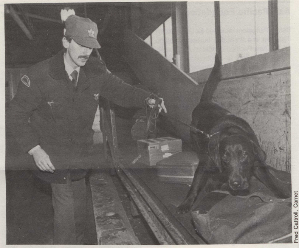
Officer and well-trained nose of a detector dog.

The dog's size is also a factor. There are German shepherds in the service but