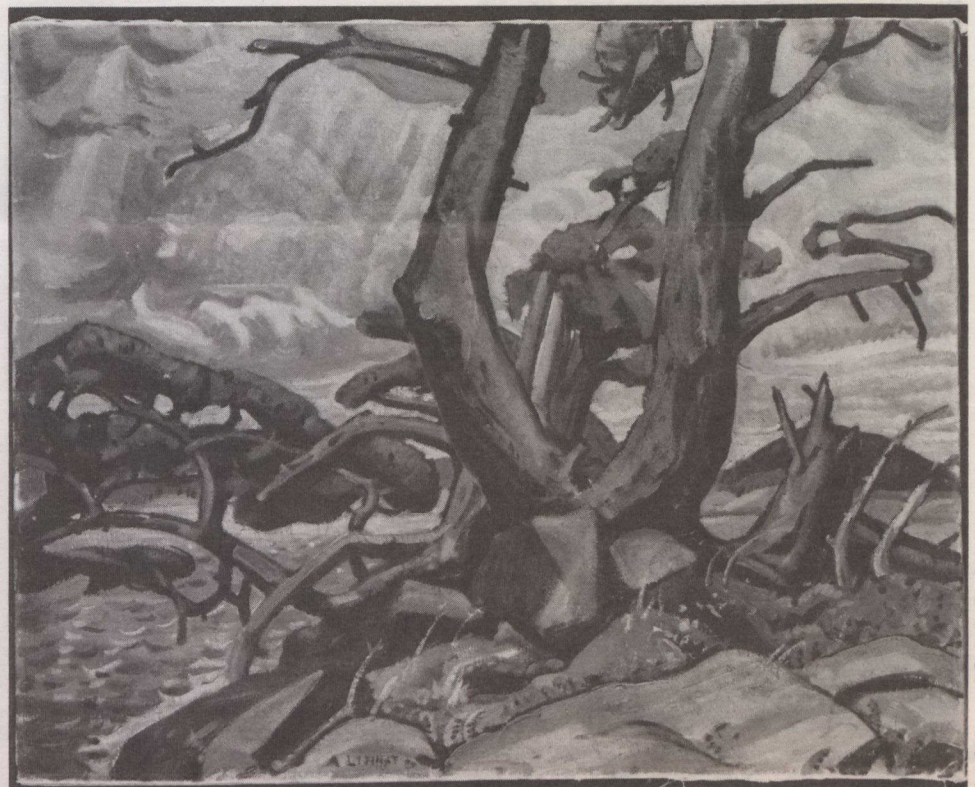
Old Pine (1929), oil on canvas, by Arthur Lismer.

treated Ontario's broad northland so differently in 1920 than in 1860 – a combination of artistic influences from abroad, developments in science, literature and philosophy, and technological advancements that profoundly changed the focus of their imagery.