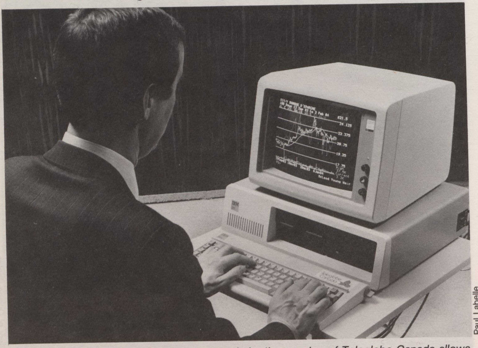
Using Telidon technology, the Novatex stockcharting service of Teleglobe Canada allows investors and financial analysts to compare instantly the performance of a given stock with other stocks or with the market in general.

Canada Weekly is published by the Public Affairs Branch Department of External Affairs, Ottawa K1A 0G2 Material may be freely reprinted. A credit would be preciated. Photo according