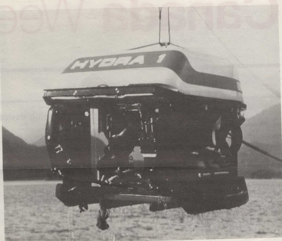
Hydra submersible, workhorse of Lavalin Ocean Systems fleet.

To maintain effective control of the worldwide operations of Lavalin International, the company's international arm, each of the five regions has been assigned a vice-