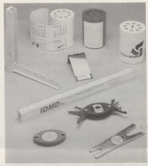
Some of the products made by the firm.

Telecom to build their Display Phone in a miniature disk similiar to the IBM which will also be shipped around the world.