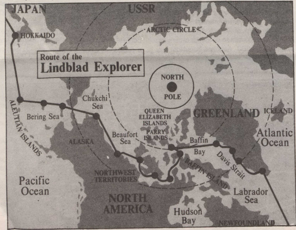
Map shows route cruise ship will take.

The most treacherous area for the vessel is in the vicinity of the Franklin and James Ross Straits just west of the Boothia Peninsula in the Arctic Islands. If the Lindblad succeeds, it will be only the thirty-fourth ship in history to complete the voyage.