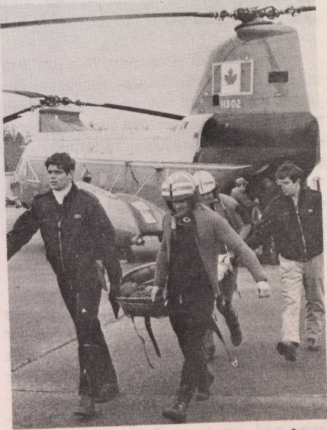
Search and rescue personnel respond to a medical evacuation in British Columbia.

During the year the four RCCs responded to a total of 9,251 incidents, an increase of 1,238 over 1978. This represents an average of more than 25 a day. Of the total number, 1,945 were air incidents, 6,566 were marine related, 515 were of a