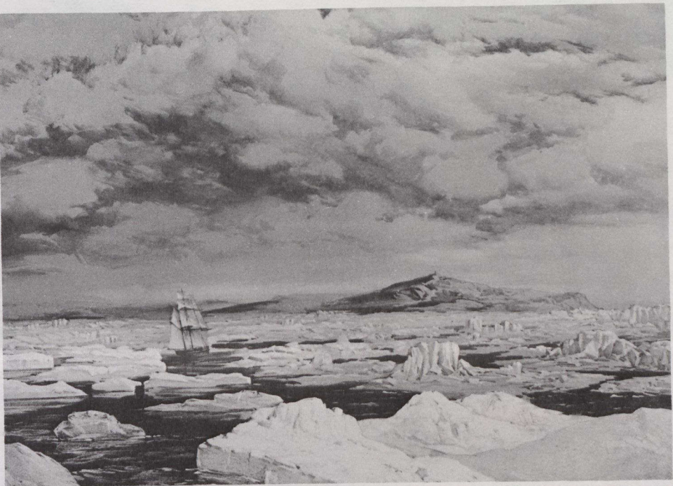
First Discovery of Land by H.M.S. Investigator, September 6, 1850, colour lithograph after sketch by Samuel Gurney Cresswell.

A view by Samuel Gurney Cresswell of the sinking of the HMS Breadalbane in 1853 is included in the exhibition. The wreck of this three-masted barque was