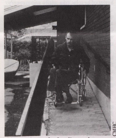
A group home for handicapped persons.

The 28-minute film, selected out of 65 entries from around the world, won in the "Integration into Society" category.