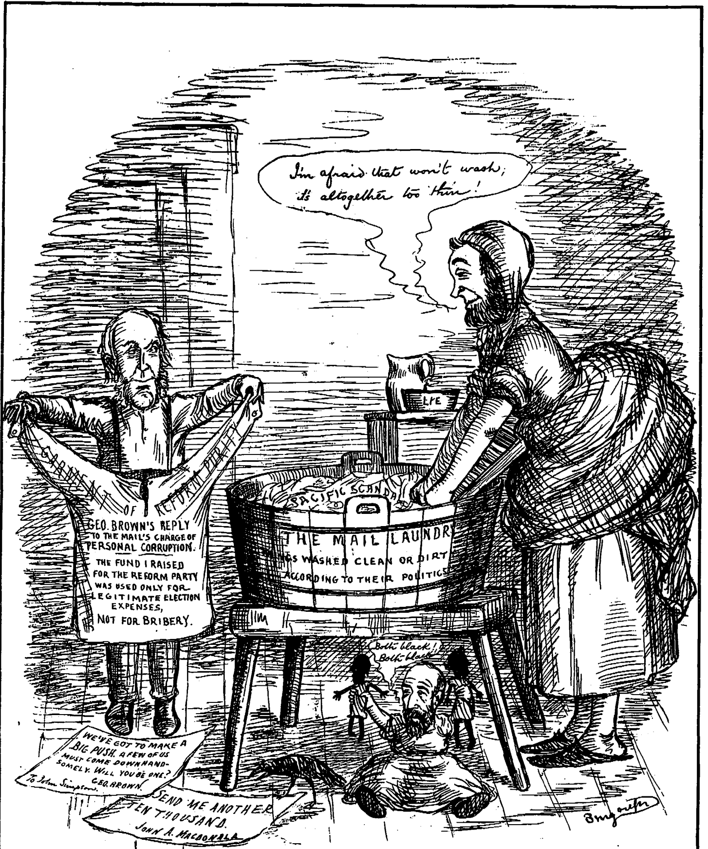
POLITICAL PURITY; OR, POT AND KETTLE.