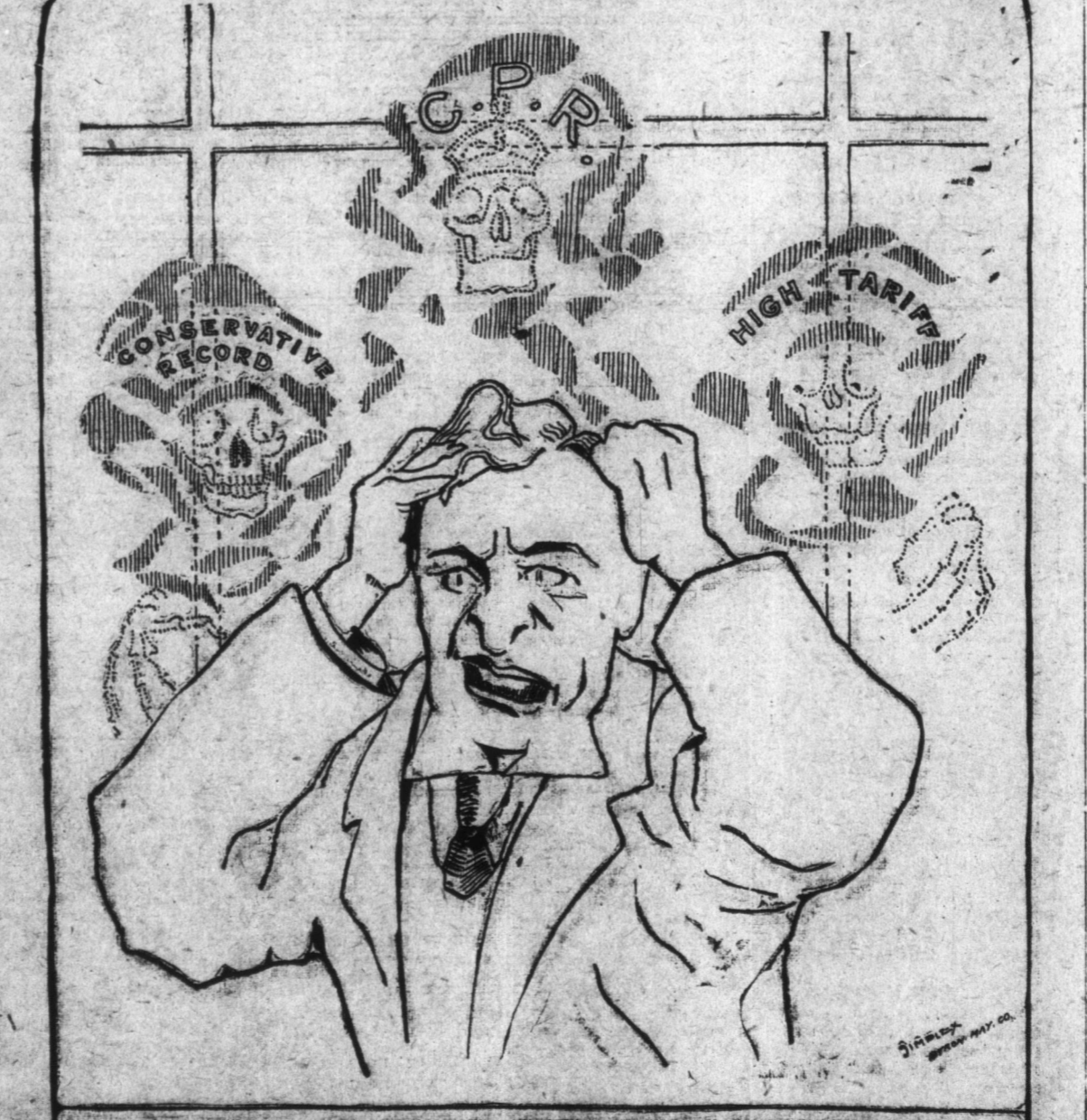
"Curses on these ghosts! They'd give the best show."

Toronto, October 16.—The milk section of the Retail Merchants' Association today decided to press for the prosecution of the producers. On a charge of an illegal combine in restraint of trade following the recent "strike" for winter rates.