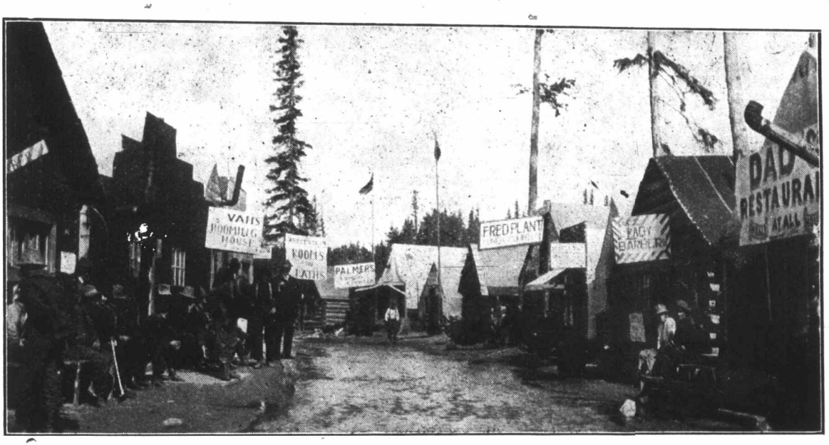
TETE JAUNE CACHE, END OF STEEL ON G.T.P.

Pour Thee the bitter, pray Thee for the sweet." God is very gracious. He can do the impossible up here; out of these broken reeds He can make sweet melody and from this smoking flax He can produce a flame which shall burn for ever to His glory and for the illuming of the nations. Pray for this work.