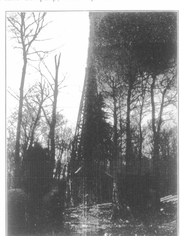
Shooting an Oil Well at Weldon, N.B.

You have here letters from some of the smaller manufacturers such as the New Brunswick Wire Fence Company, which quotes:—