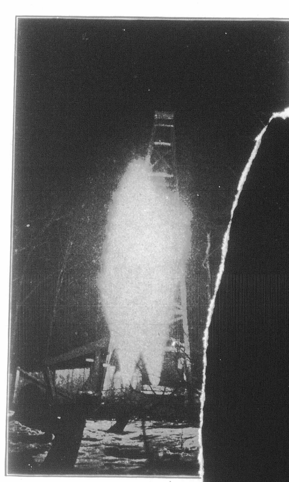
75-foot Gas Flame at Weldon, N.B. Night.

fairs has also passed away, re taking a most acfinding some of r the able vinister of