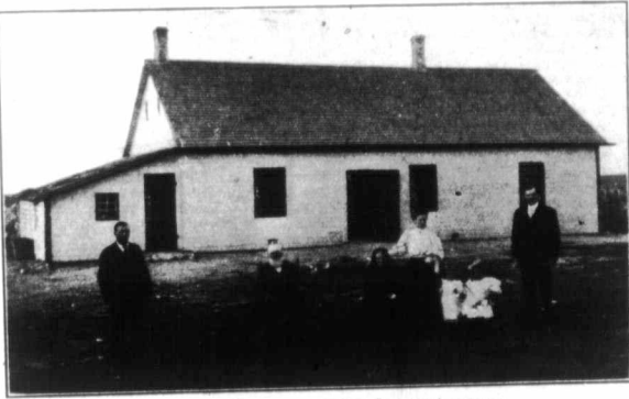
A TYPICAL GERMAN HOME IN SASKATCHEWAN.

meadow-lark chirped "Beautiful world! while the gentle Beautiful world! breeze took up the strain and carried the joyous message to the pale-faced crocuses that were just peeping above the patches of snow