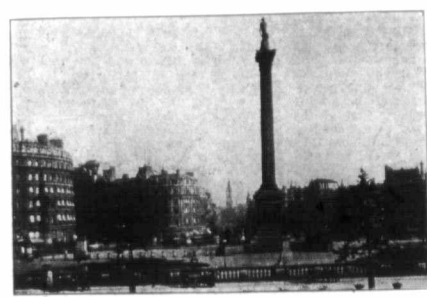
TRAFALGAR SQUARE AND NATIONAL GALLERY, LONDON.

While in camp in London, we visited many more of the places of interest, including the Tower, Westminster Abbey, the British Museum, Madam Tussaud's Wax Works, the National and Tate Galleries, and the Zoo.