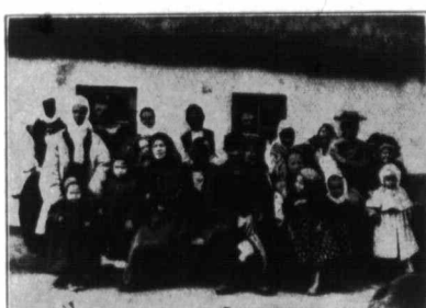
A RUTHENIAN FAMILY PARTY.

Note.—This programme is only suggested. The papers should not exceed eight or ten minutes at most, the president's address need only take a very few minutes, other and more acceptable hymns may be chosen, the offering may be devoted to the general fund, and the Epworth League hymn is still on sale at the General Secretary's office, in sheet form, at one cent a copy, in lots of not less than ten. The Editor wishes for every League a very happy and prosperous rally, and expresses the conviction that such will be realized in the great majority of cases, because he knows the young people are capable of great things and willing to plan and work for them.