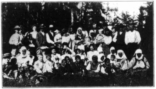
EVERYBODY ENJOYS A PICNIC.

The following suggestions apply equally to Adult or Junior Leagues, and should be faithfully carried out in some way and to some extent in all places.