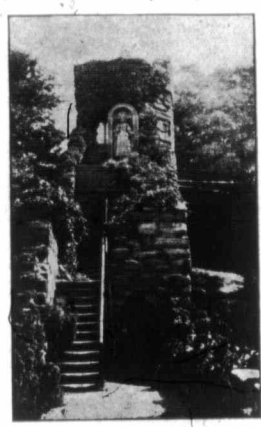
WATER GATE, KING CHARLES TOWER, WARWICK CASTLE