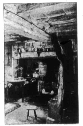
INTERIOR, ANN HATHAWAY'S COTTAGE

The whole trip was a series of glad surprises, but the feature which came as a great revelation was to see the appreciation the British people had for our Canadian boys. They seemed to deem it an honor to make every minute of our stay in the Old Land as enjoyable as pos-This feeling permeated not only