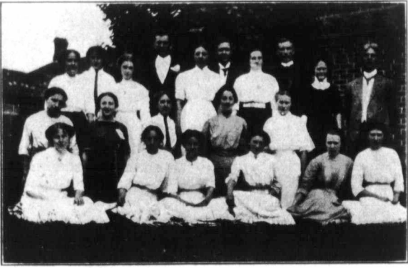
TEACHER TRAINING CLASS AT ELORA SUMMER SCHOOL

ceiving a diploma, but that a goodly number of Teacher Training Classes will be organized in the local schools from which these students came. The lectures of nder twenty constitutes the most importnt period in life? 3. Suggest some way in which life is couraging. Other schools will probably