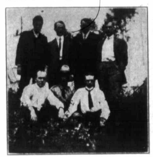
STAFF OF INSTRUCTORS AT ALBERTA SUMMER SCHOOLS.

Wesleyville, with Brookheld and Newton as important parts of the cincuit, afforded a fine opportunity for helpful