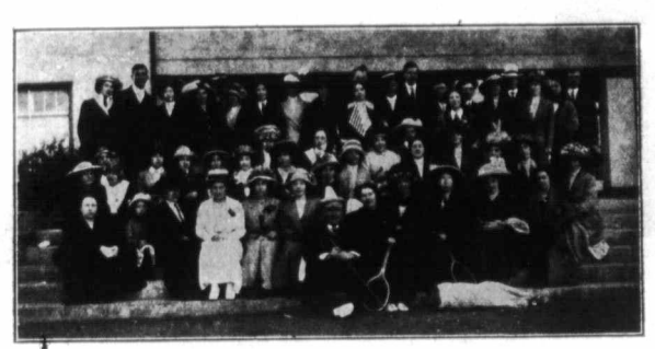
ORGANIZED CLASS OF YOUNG LADIES, GRACE CHURCH, WINNIPEG.

What are our resources for this great work? We have splendid equipment in colleges, churches, schools, young peoples' societies, hospital and orphanages. Our greatest need is men, consecrated, ready for the hard places, willing to serve any where, and keep on serving. We need money—we have enough—Methodism is rich, but sufficient to meet the needs of the work has not been consecrated for The call has come to the young people to man our home missions and take a share in our tremendous work of nation-building. Canada's mission to the nation will not be realized until we give both men and money.