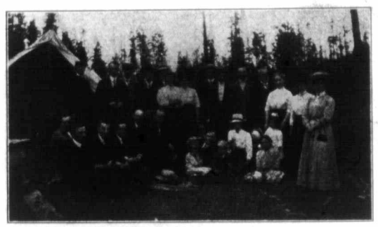
A GROUP AT THE EAST KOOTENAY, B.C., SCHOOL.

We must pause to commend the zeal and devotion of the Sunday School workers of New Melbourne, who, when natified late the previous evening of our passing through next morning, gathered for a ten o'clock session, busy though