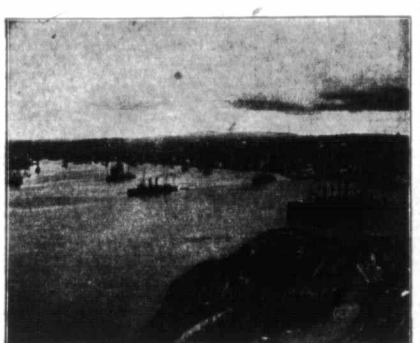
HARBOR OF ST. JOHNS, NEWFOUNDLAND

The church that can capture about nine hundred young lives with their unmeasured influence for the Kingdom, will have contributed untold resources to it. What a goal for a church to set before itself! "Unto Him that is able to do exceeding abundantly, etc." It was 11.30 Monday night when the teachers of the circuit permitted the Institute to close (The last item was a Round-table.)