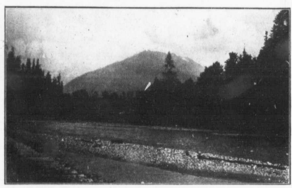
A CHARMING SCENE ON THE VEDDAR RIVER, CHILLIWACK VALLEY, B.C.

This is but a sample tragedy of what may befall young men plunging into the untamed West, unarmed by a trust in Jesus Christ and connection with His Church. The one way of their rescue is by sustaining our work faithfully along "the firing line."—Service