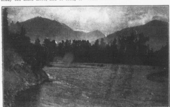
ON THE VEDDAR RIVER, CHILLIWACK VALLEY, B.C.

Meetings of the class were suspended for the summer, but resumed again in the fail with one member absent owing to removal, and two new ones joining. In April,1911, after nearly two years