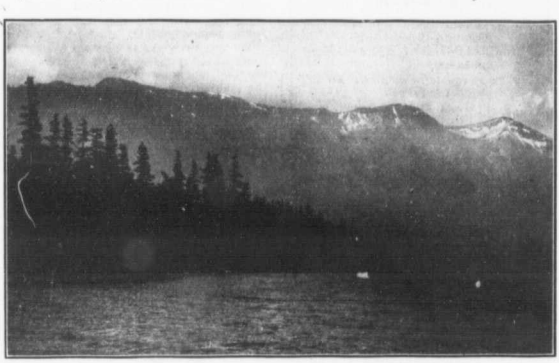
CULTUS LAKE, CHILLIWACK VALLEY REGION, B.C.

There was once a boy who did not mind at all losing money, so the pieces were pennies. Again and again he was heard to say: "O, it was only a penny!" When he grew a little older, he worked during the vacation for his father, and every Saturday night his father would pay him five hundred pennies. At first the lad was careless with his pennies. At the end of the first month, when he counted his money, he had only $15. In great distress he came to his father. "Father," he said, "what do you reckon? I've lost $5