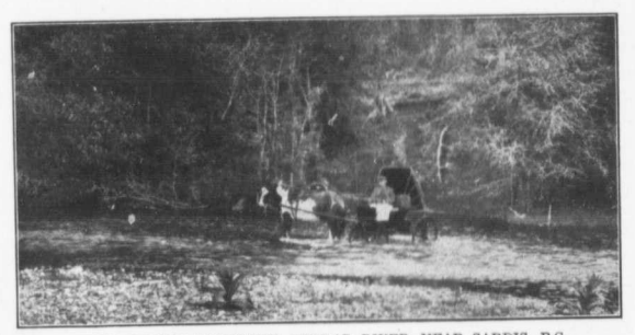
A FORD OF THE BEAUTIFUL VEDDAR RIVER, NEAR SARDIS, B.C.

qualities is most necessary, but it seems to me, without consecration there would be little accomplished by the other requisites. The highest aim of the Sunday School is winning the boys and girls day school is winning the boys and training them for active Christian work for the church. Only a teacher who is consecrated in God's service could accomplish this; so I think a consecrated teacher with only a few of the other qualities is better than one with all the other qualities, but lacking con-secration. Children are very quick to detect the true from the false.