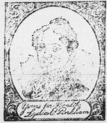
Yours for Health Lydia E. Pinkham

This remarkable woman, whose maiden name was Bates, was born in Lynn, Mass., February 24, 1829, coming from a good old Yankee family. For some years she taught school, and is now known as a woman of an alert