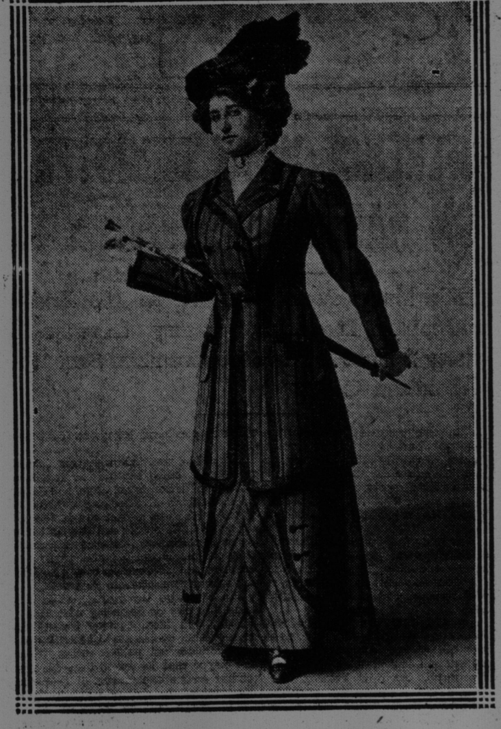
THE POPULAR TWO-TONE SERGES.

One of the smart fancies of fall is the two-tone serges in dark colors, made up quite simply and without the elaborate mixing that marked the creations.