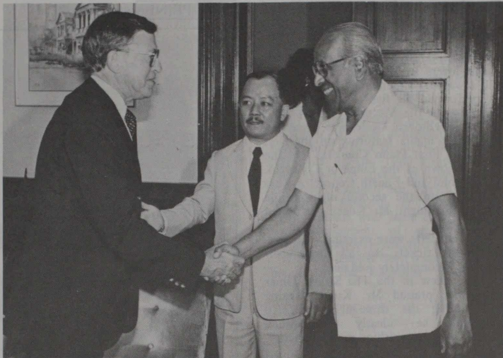
Singapore: Canada's Minister of National Defence, Gilles Lamontagne, (left), is introduced to Second Deputy Prime Minister (Foreign Affairs), S. Rajaratnam. Mr. Lamontagne also had a meeting with the Minister of State for Defence, Dr. Yeo Ning Hong, which included discussions on the sale of Canadian defence products to the Singapore Armed Forces.

During his stopover in Singapore from April 2 to April 4, Mr. Lamontagne called on the Minister of State for Defence, Dr. Yeo Ning Hong, and reiterated Canadian support for ASEAN and its efforts to promote a peaceful solution to the problems of Cambodia. He took the opportunity to explore the possibility of Canadian defence sales to Singapore,