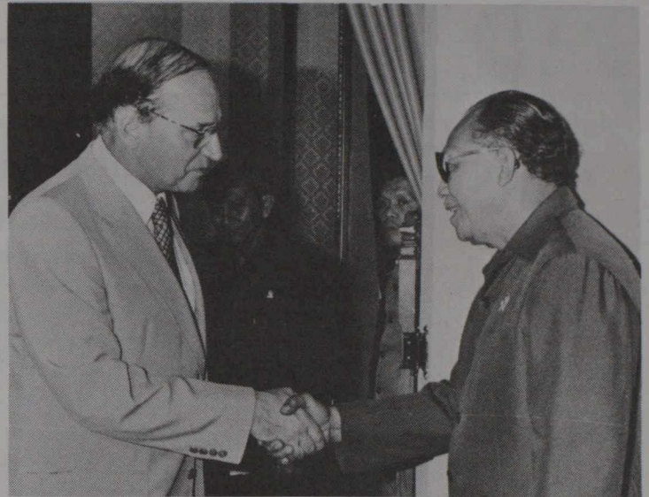
Mr. Regan (left) is welcomed to Jakarta by Umar Wirahadikusumah, Vice-President of Indonesia (right).

The Integ/Sargent Lundy consulting contract for $10.21