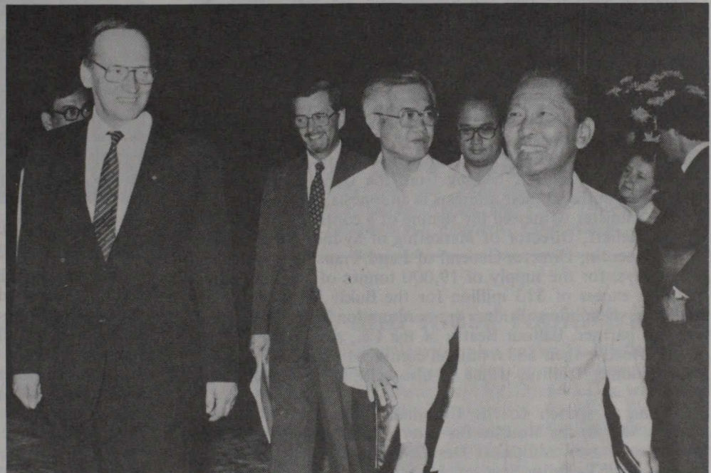
Canada's Minister for International Trade, Gerald Regan (left), is received by President F. Marcos (right) and Prime Minister C. Virata (centre) during his visit to the Philippines.