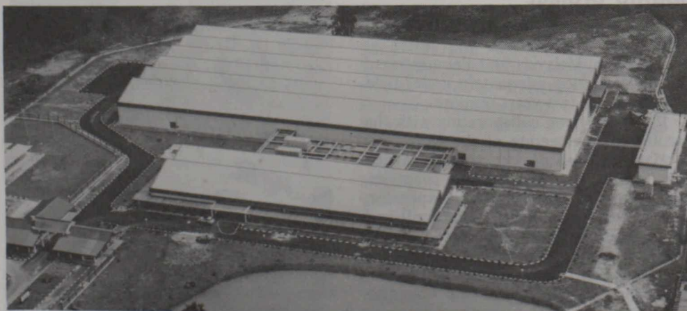
Bata factory in Seremban, West Malaysia: the latest factory to be built in the region was opened in August, 1982 and provides employment for up to 600 employees.

Employing around 1900 people, the company sells about 11 million pairs of shoes annually, a small percentage for export. The marketing outlets have been painstakingly developed. There are now over 100 retail stores and close to 1200 independent retailers to service the needs of both the urban and rural populations.