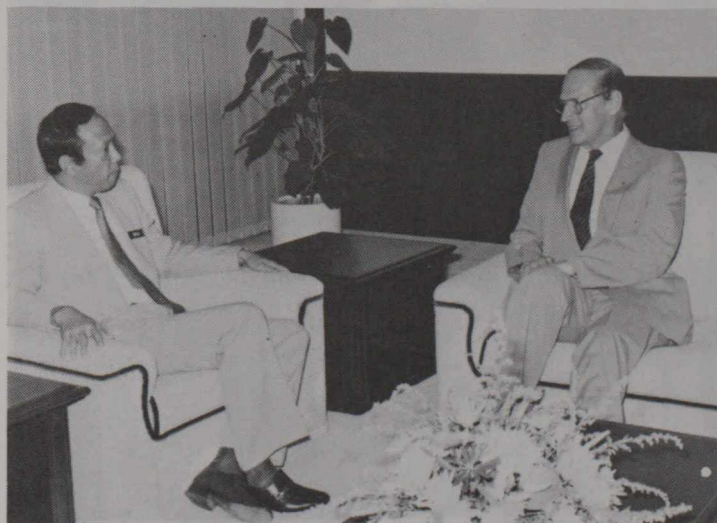
The Minister for International Trade pays a courtesy call on Y.B. Datuk Musa Hitam, Deputy Prime Minister of Malaysia.

The Minister for International Trade then held a meeting with Datuk Leo Moggie, Minister of Energy, Telecommunications and Posts, to discuss Canada's capabilities in these fields. Canadian exporters are very keen to participate in two major Malaysian infrastructure projects: the Port Kelang power generation station and the East Coast natural gas distribution system. Mr. Regan paid a subsequent call on Tengku Razaleigh Hamzah, Minister of Finance, to discuss the abilities of the Canadian government and financial community to provide competitive terms of credit for major export sales. Finally, the minister reviewed Canadian-Malaysian political relations with Deputy Prime Minister Datuk Musa Hitam. Datuk Musa declared that our bilateral relations provide a model for co-operation between North and South nations.