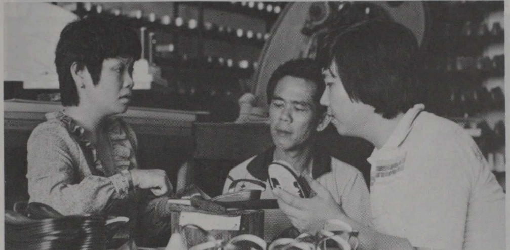
Counselling local artisans on the manufacturing of footwear.

Playing a key role here is the Bata International Centre, the organization's central office, located in Toronto, Canada. The centre organizes conferences, meetings and courses covering the entire spectrum of footwear manufacturing, marketing and management. It also provides member companies with a continuous stream of information and ideas.