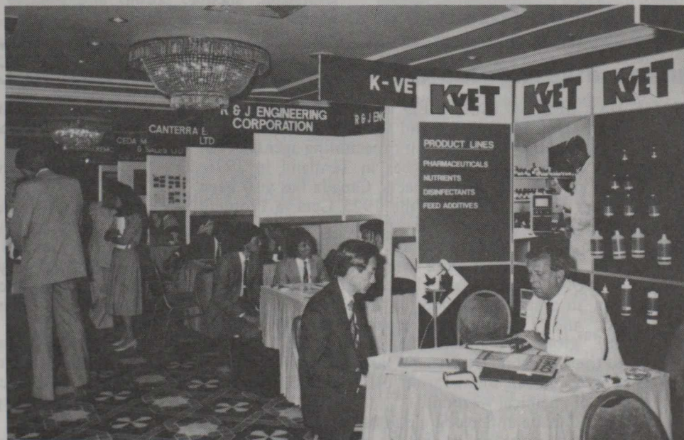
Company representatives discuss their products with ASEAN businessmen.

Canex '83 was the third technology exchange organized by the High Commission in Singapore for the ASEAN region. CIDA pays basic travel and hotel expenses for participants and seeks to encourage collaboration by inviting companies which have the technical, managerial and financial strengths necessary for undertaking joint-ventures. Once potential partners are identified, companies may apply to CIDA for additional financial support, which may include up to $100,000 to help defray the costs of a viability study for an individual project.