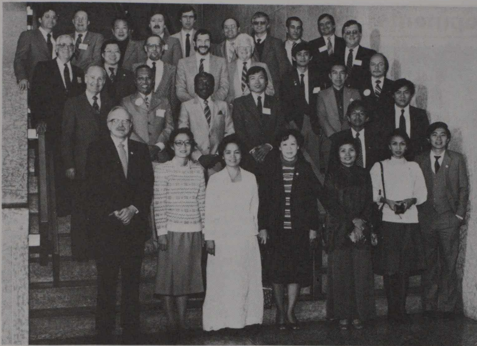
Canadian and ASEAN delegates assemble at the Manitoba Institute of Management, in Winnipeg, Manitoba.