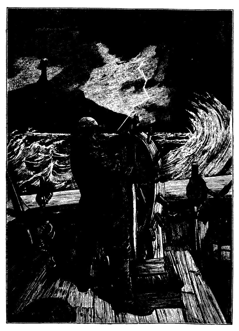
THE SEA CAPTAIN.