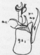
Fig. 3.— Sarcophaga vancoverensis , n. sp.: genitalia of male.

Genitalia.—See figure. Anterior claspers (a. c.), posterior claspers (p. c.), accessory plate (a. p.).