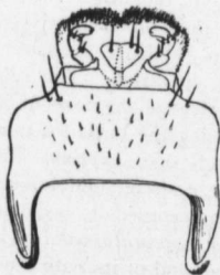
Fig. 4.— Leptinillus apodontis n. sp.; labium.

the mentum itself. Pronotum anteriorly of the same width as the head, posteriorly about twice as wide, the greatest width about one and one-half times the length, the lateral margins arcuate.