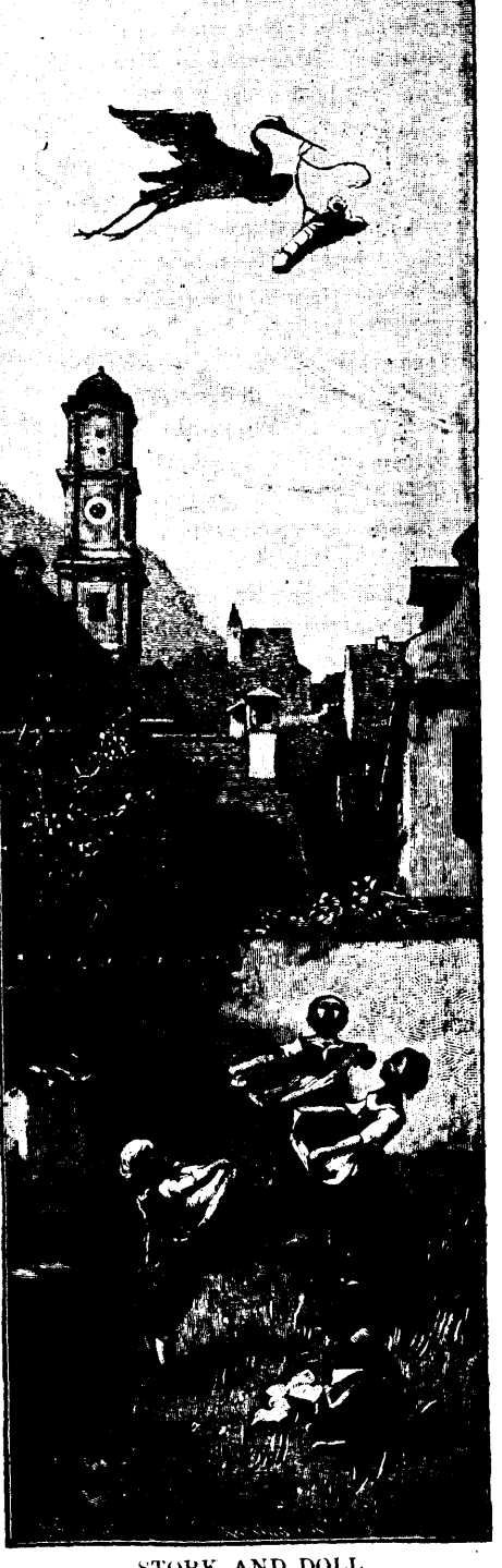
STORK AND DOLL.

A young man in the north of Ireland, who had signed the temperance pledge, was tempted by his old associates to go and have a drop of whiskey. He bravely withstood the temptations and jeers for some time, till one day they said they would force him into the public-house. They got him as far as the door, and had pushed him inside, when he held fast to the door-posts; then, twisting himself round, while they held to his coat, he pulled himself away and ran home, leaving his coat tails in his tormentor's