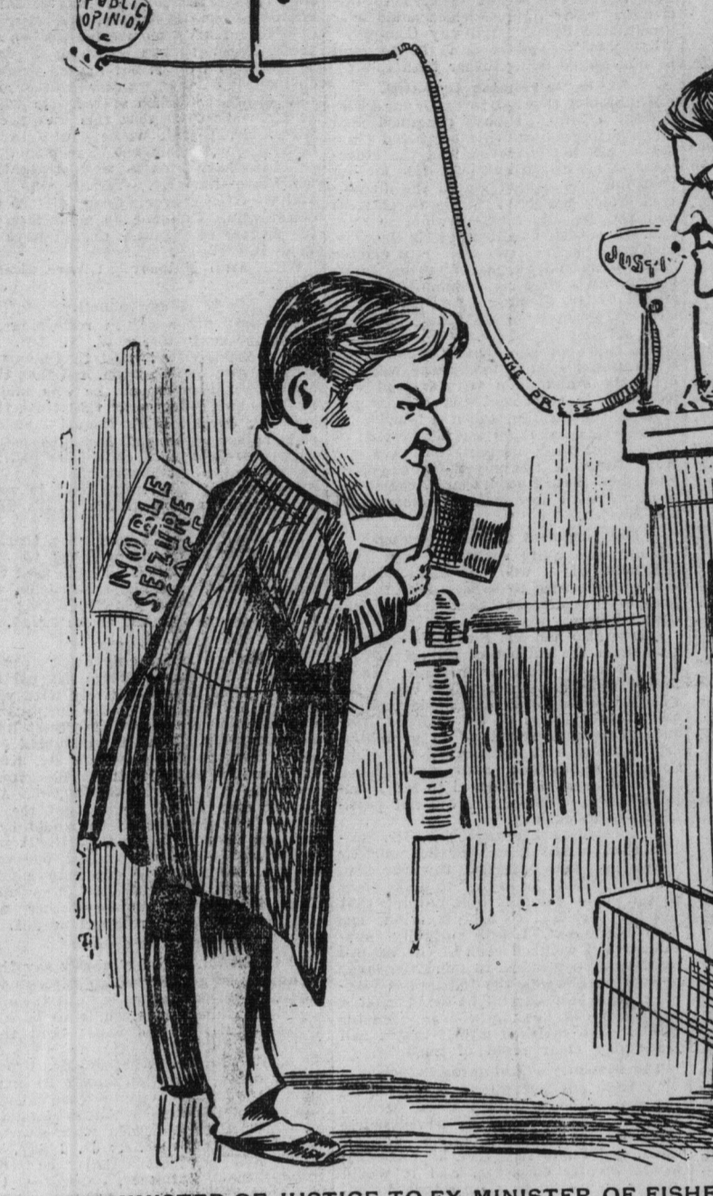
NEW MINISTER OF JUSTICE TO EX-MINISTER OF FISHERIES: SEEN IN THIS LIGHT, YOUR ACTION IN THE NOBLE SEIZURE CASE DOES NOT FULLY MEET WITH MY APPROVAL, AND I SHALL TAKE STEPS TO REVERSE IT.