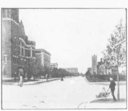
ORNE STREET LOOKING NORTH