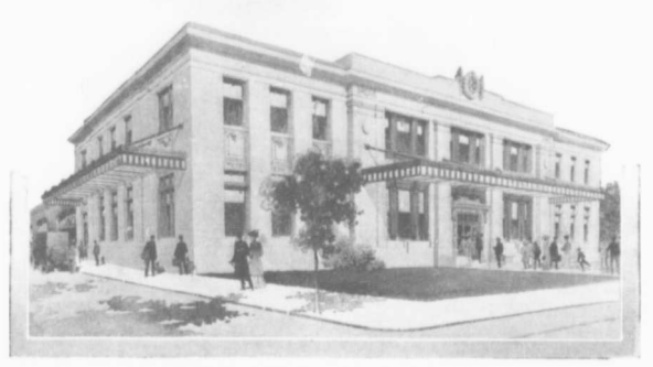
NEW GRAND TRUNK PACIFIC BAILWAY STATION

Then Regina, besides being the Provincial capital and seat of Government, is situated in the very heart of the grain area of Saskatchewan, and is therefore bound to be the chief commercial centre. This honor has been hers since the first settler arrived in the Province, and all indications point conclusively to the city being the permanent home of the Legislature.