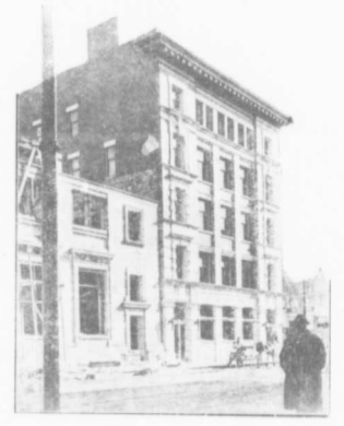
WESTERN TRUST BUILDING

Solid evidence of Regina's magnificent position as a city of ever increasing prosperity is supplied by the Customs Returns for the year ending 31st March, 1912. Regina's total is $843,194 an increase of $194,951 over the previous year. The ratio of increase is remarkable. While Toronto's percentage is 11.7, Montreal's 8.2, Vancouver's 23.1 and Winnipeg 24.3, Regina's increase exceeds 30%. Of all the