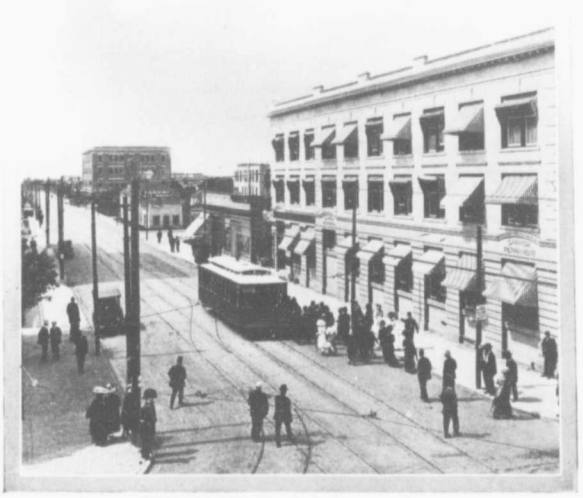
ELEVENTH AVENUE, IN THE COMMERCIAL DISTRICT

municipal debentures is actively carried on, namely, Toronto, Montreal and Regina. It is gratifying to note that several of the large issues recently marketed in Western Canada, were purchased by firms operating in Regina. Amongst others may be mentioned: The city of Prince Albert $285,000; city of Regina, $229,200; Brandon School District, $95,000, while the smaller Western municipalities and school districts throughout the entire West having debentures for sale, send their representatives to Regina to arrange for the disposal of the bonds.