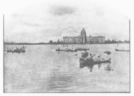
WARCANA LAKE AND PARLIAMENT BUILDING

cost to the citizens, out of the proceeds of the sale of its townsite property. The City Hall is the home of all the municipal departments and cost, with its equipment, about $200,000.