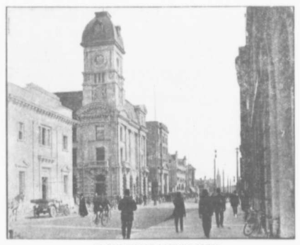
SCARTH STREET LOOKING SOUTH

step my companions and myself found we had everything to learn. Winnipeg is a sple n didly built city, admirably paved, of brilliant sumptuous ness and a place where