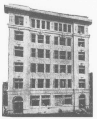
NEW "LEADER" BUILDING

Improvements to the Exhibition Grounds have already cost over a quarter of a million dollars, and still further improvements are to be made. There are now three large main buildings and two grand stands, fifteen well-equipped horse and cattle stables, four racehorse stables, and a large arena for judging, also a half-mile race track complete in every detail, a large building used as a secretary's office, and numerous other smaller buildings. Waterworks and sewerage extend through the grounds, and hydrants are placed at various points. All buildings are equipped with electric lights. The main buildings and the grand stands are illuminated with strings