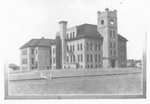
A TYPICAL REGINA SCHOOL BUILDING

Eleven of the leading Canadian Banks have branches in Regina and one of these has also a branch office to cope with their rapidly increasing business. The majority are located in their own premises, and at least one chartered bank, not at present in the city.