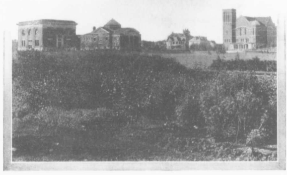
A BIT OF VICTORIA PARK AND LORNE STREET