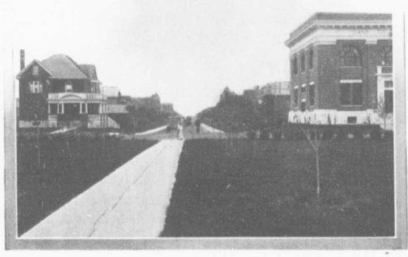
A VIEW ACROSS VICTORIA TARK