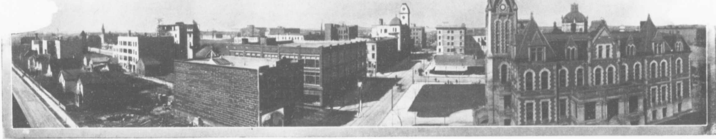
IN THE HEART OF THE BUSINESS DISTRICT

In the city itself there are now most of the attractions that modern cities have to offer. All the up-to-date conveniences, such as electric lighting, street railway, abundance of good water, excellent schools and colleges, public library, etc., are provided for. Sports are encouraged in a hundred ways by baseball, lacrosse, football, golf and tennis clubs, swimming baths, gymnasium and kindred opportunities for physical culture. The theatres in the city are modern