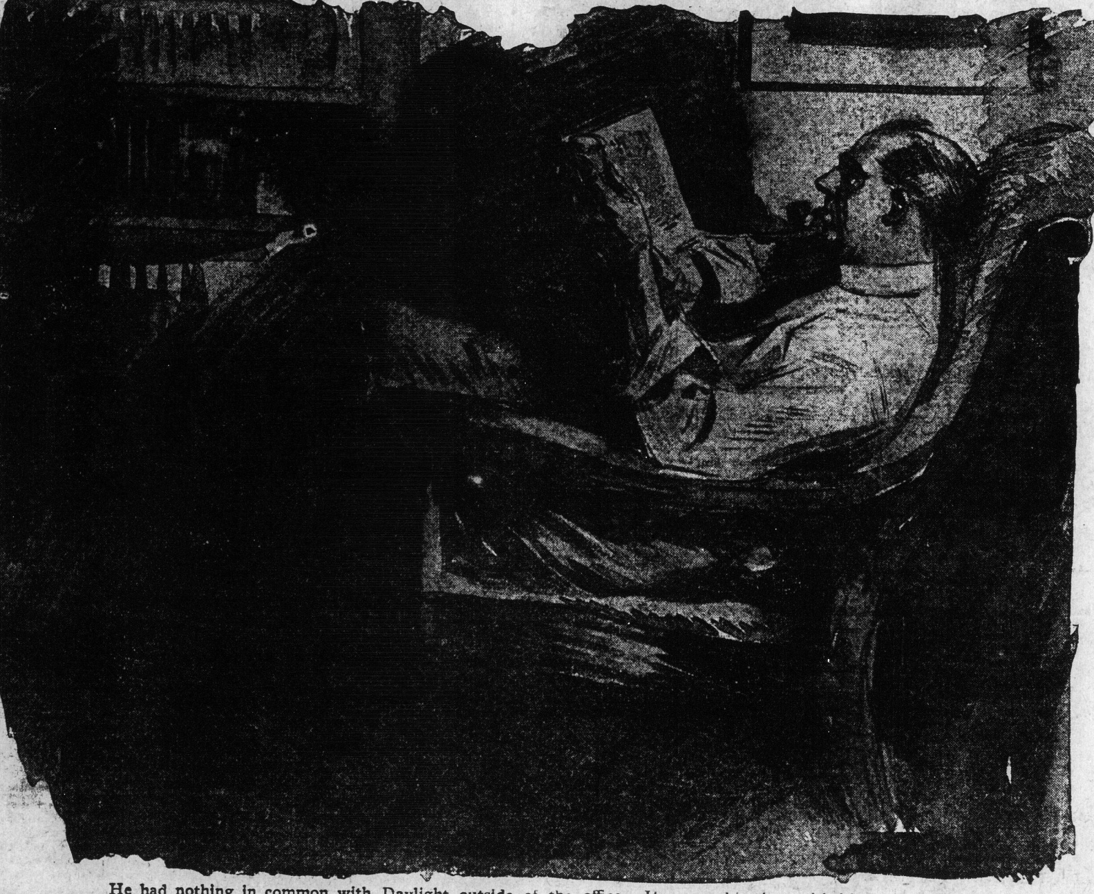
He had nothing in common with Daylight outside of the office. He spent his time with his books.

He looked at her in honest and pondering admiram. "Won't you sit down?" she repeated. He felt like an animal long denied food. His hunger for her welled up in him and he proceeded to "wolf" the dainty morsel be. - him. Here was no patience, no diplomacy. The straightest, directest way was none too quick for him and, had he Besides, as I fold you, I'm green at it. I never known it, the least unsuccessful way he could have