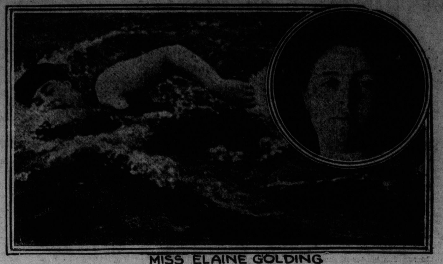
in many endurance swims throughout the country and holds several long distant