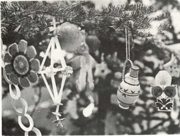
Eggshells and paper cut-out decorations