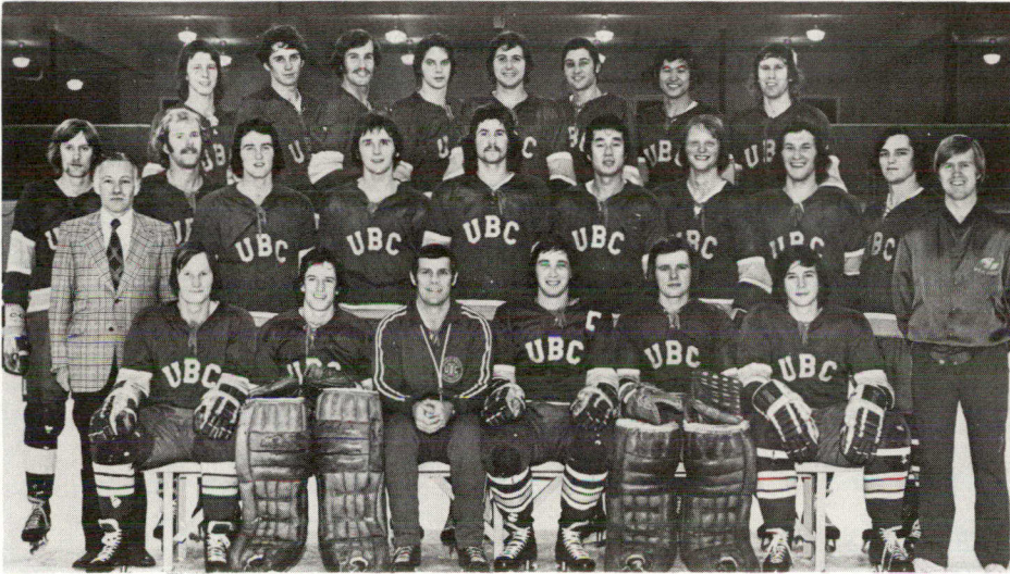
The "Thunderbirds" hockey team of the University of British Columbia, which is at present touring China under a program of cultural exchanges. Dr.