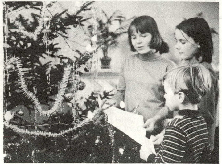
O Tannenbaum is a popular Christmas carol

made by children, along with straw and cut-out eggshell creations. Polish and Czechoslovakian traditions have kept these arts alive in Canada and have made it possible for Canadians to choose from many delicately created papier mâché objects for their Christmas trees. Even factories now try to reproduce Christmas decorations so that they look hand-made. In Greek and Italian families the trees are often adorned with things that are good to eat, glazed fruits, and tiny baskets of sweets. By now gingerbread Santa Clauses are international and the Dutch Black Peter is a regular pre-Christmas visitor in many orphanages.