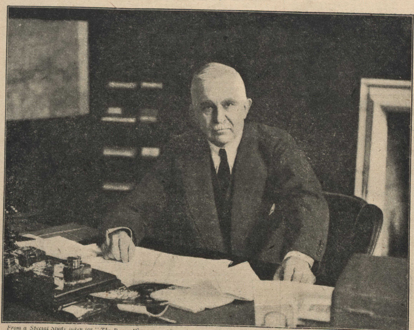
From a Special Study tuken for "The Beaver"