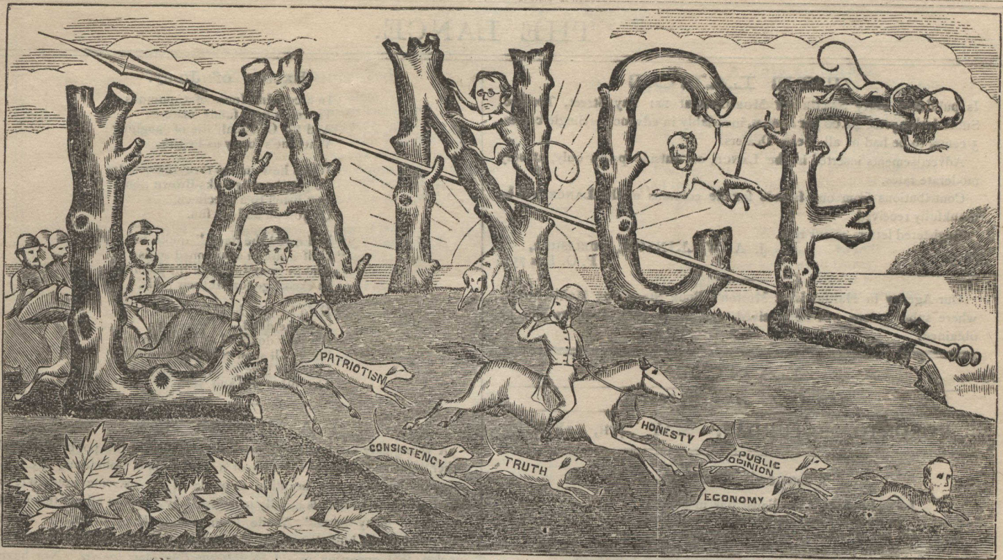
"No one ever employed sovereign power, acquired by guilty measures, to promote good ends."—Tacitus.